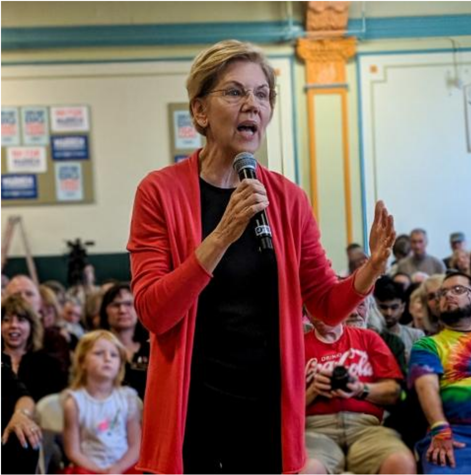
Elizabeth Warren campaigns in Nashua, New Hampshire in May 2019

Sen. Elizabeth Warren's town hall snakes down the sidewalk more than an hour before the event begins.