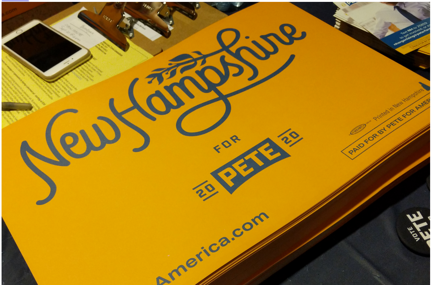
Pete Buttigieg New Hampshire campaign memorabilia displayed at state party convention.