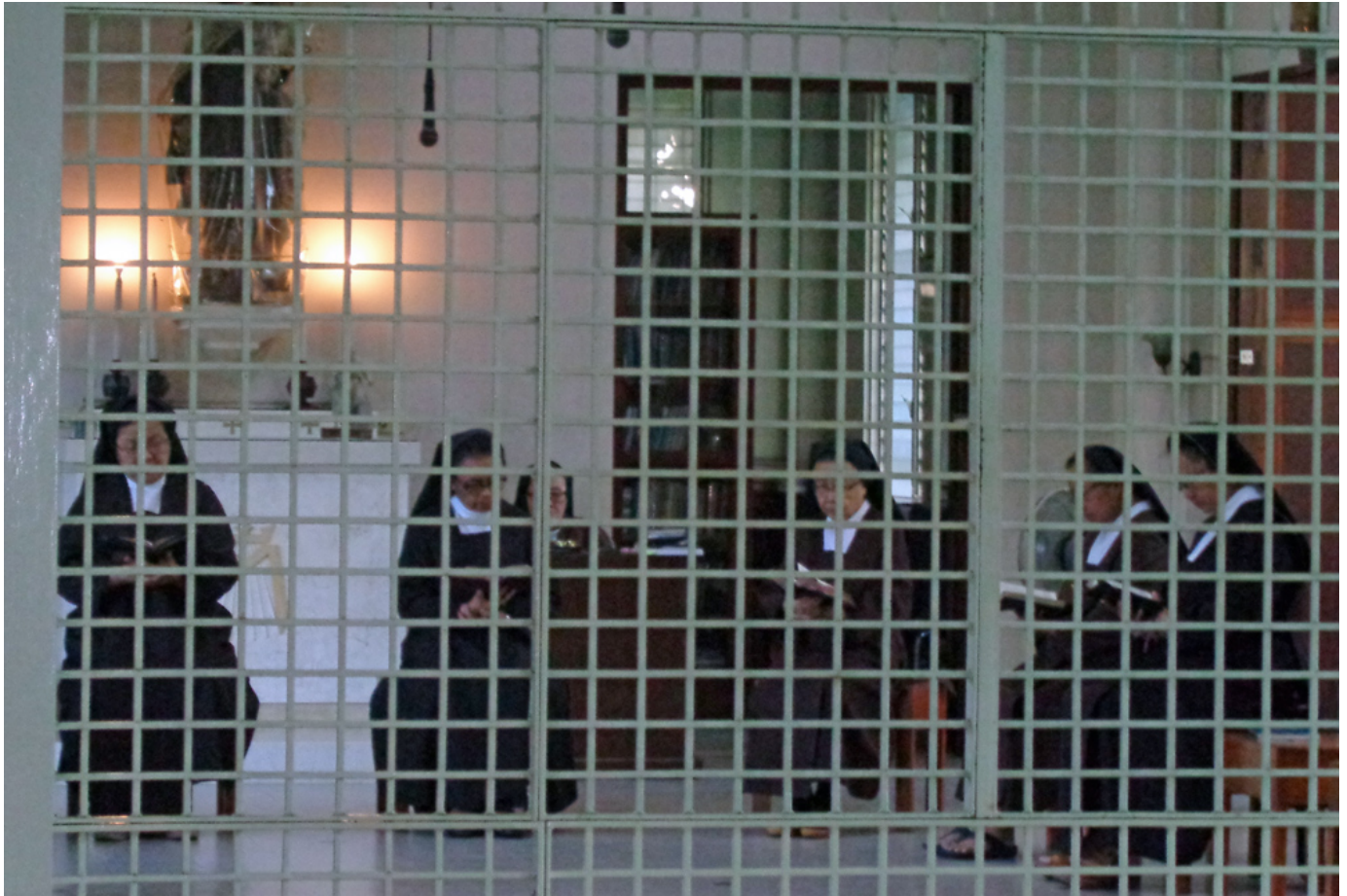
The Carmelite nuns chant the mid-morning prayers of the Liturgy of the Hours.

Seven times each day, the community gathers to either celebrate the Eucharist or chant the Liturgy of the Hours. Each nun then has two hours a day scheduled for silent prayer, "but the spirit of prayer overflows into the hours of readings, study, work and recreation." A Carmelite usually stays in her room to pray and meditate on the Word of God, unless she has other duties.