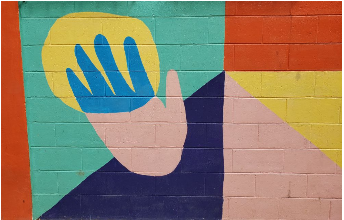
Detail of a mural on an exterior wall of a youth center in Apopa, El Salvador, painted by young people that depicts the joy of the Color Movement

"The sisters are one color, the youth another color, Alight another," she said. "The combination will bring out a new color, and that's the color of hope."