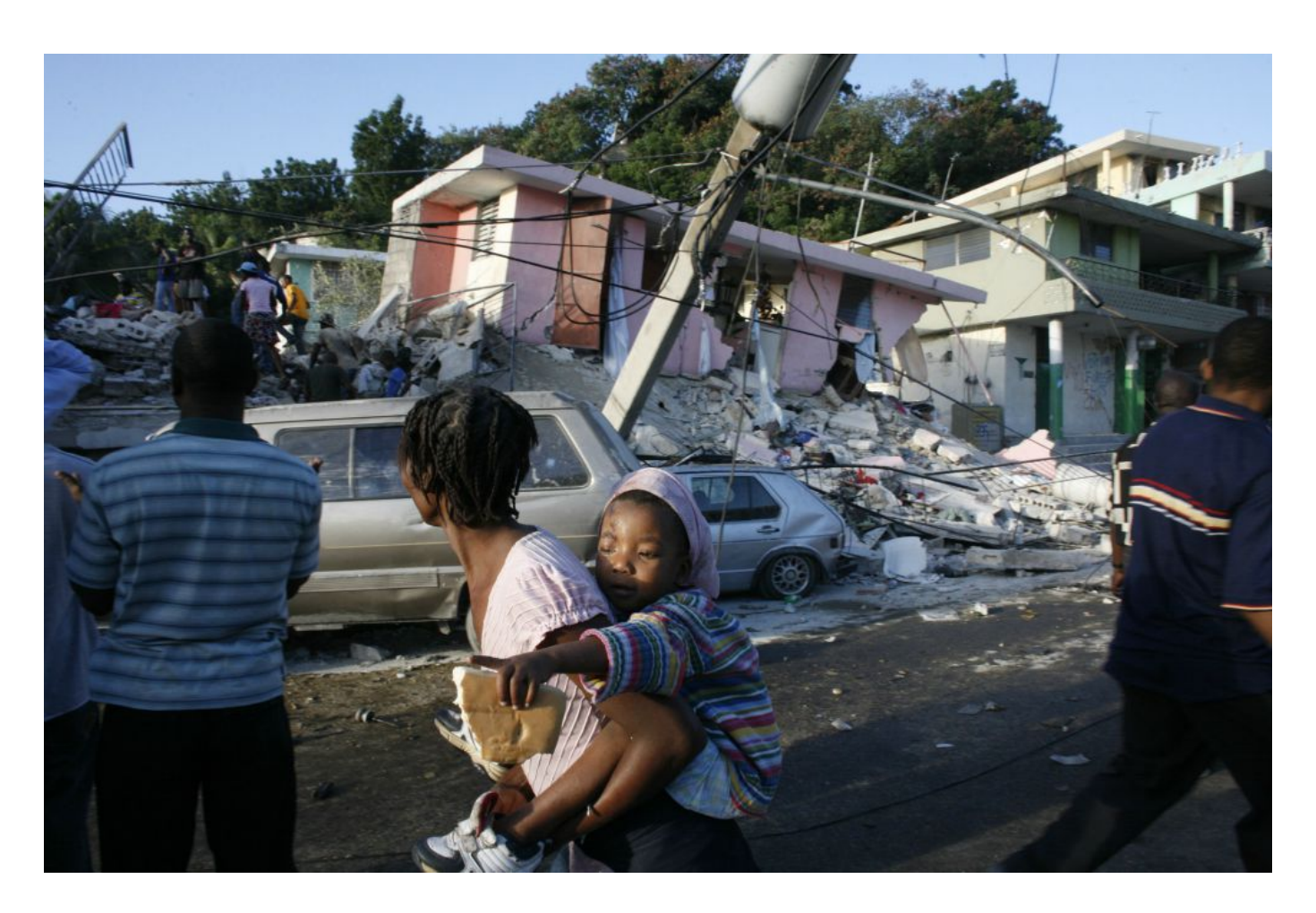
People walk past destroyed buildings in Port-au-Prince, Haiti, on Jan. 13, 2010.