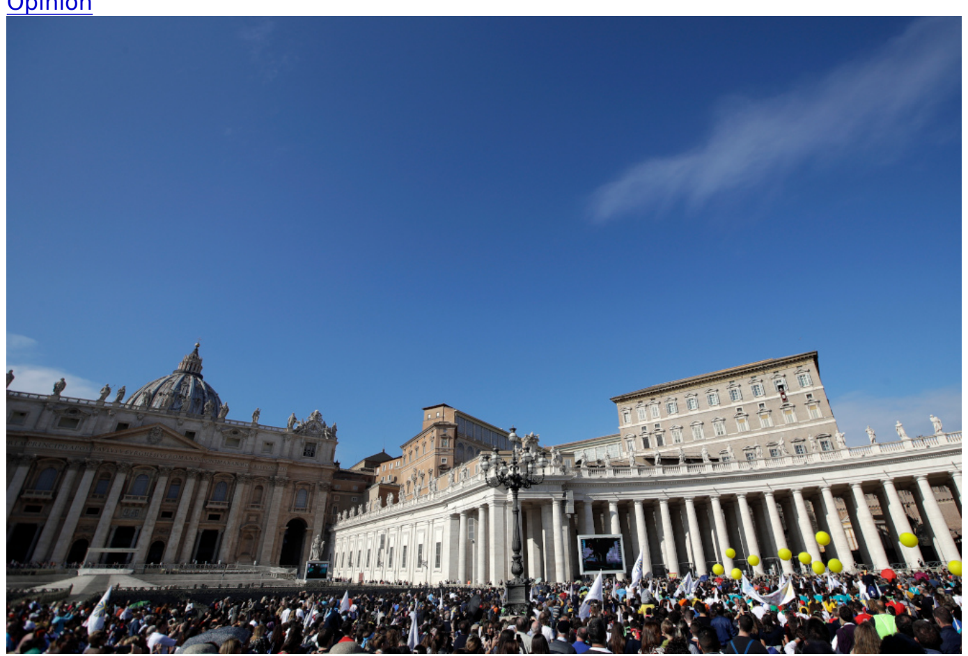
People gathered in St. Peter's Square, Rome, for the Angelus noon prayer Oct. 6, 2019.