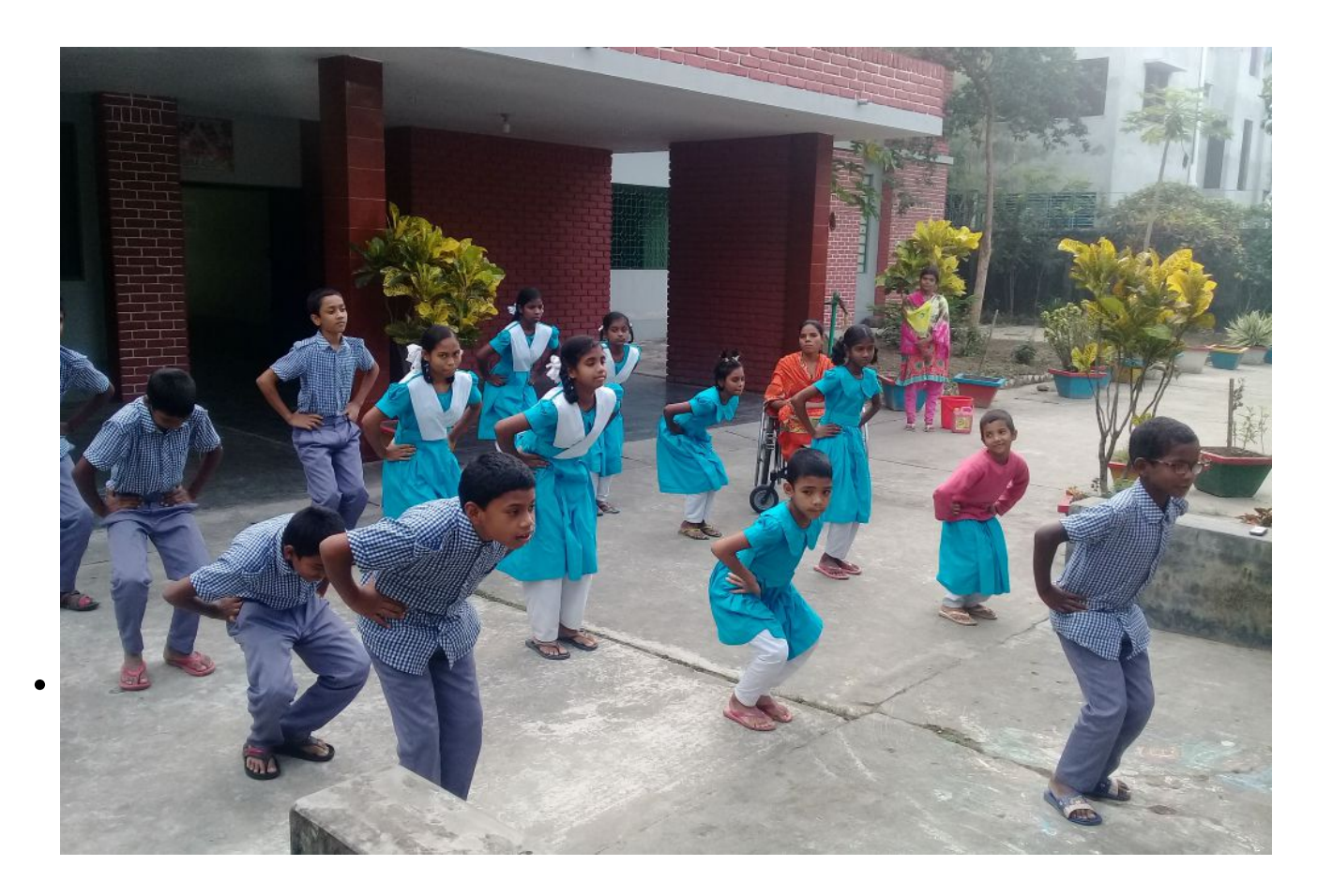
Children of Snehanir exercise before their sign language class at Snehanir in Rajshahi, Bangladesh. (Sumon Corraya)