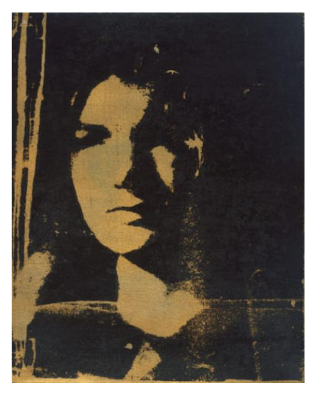
Andy Warhol, "Jackie," 1964 (The Andy Warhol Museum, Pittsburgh/©The Andy Warhol Foundation for the Visual Arts, Inc.)

One room is dedicated to images of Marilyn Monroe and Jackie Kennedy — celebrity standards of 20th century American culture, transformed into contemporary icons. While forever crystallized in the common imagination as women of glamour and poise, in this context, they are, we are also reminded, linked by lives ultimately defined by great suffering — reminiscent of Mary's title as Our Lady of Sorrows. Images of Warhol's mother accompany these works — an indication that Warhol not only maintained a great reverence for his mother but also could attest to her own hardship, having lost her husband Andrej, when Warhol was only 14. Here,