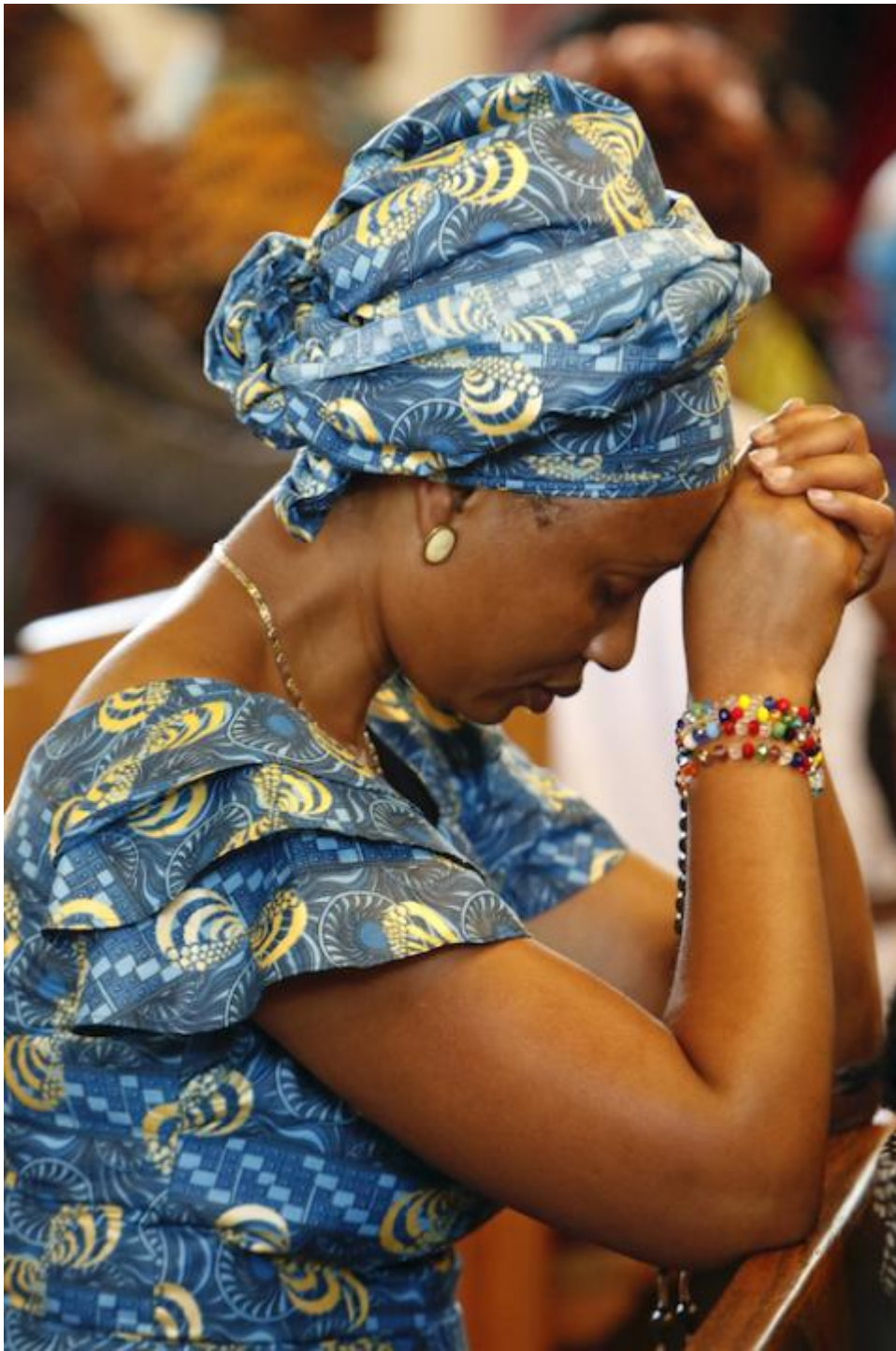
A woman prays prior to a Mass for Catholics of Nigerian descent July 21, 2019, at St. Thomas the Apostle Chapel in West Hempstead, New York.