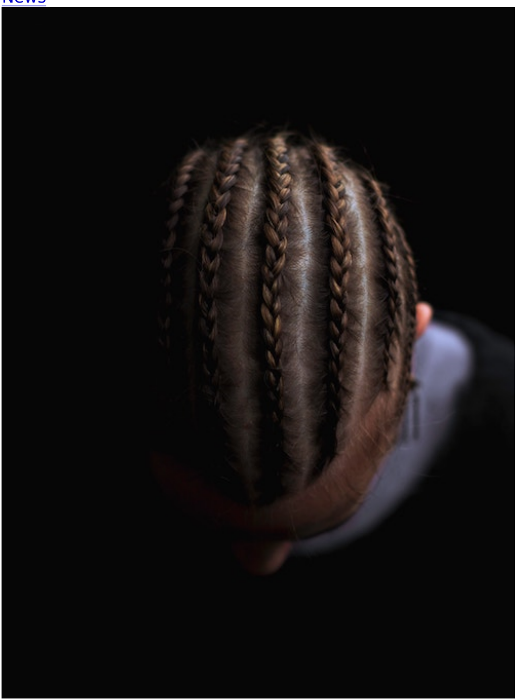
A model displays hair styled in cornrows.