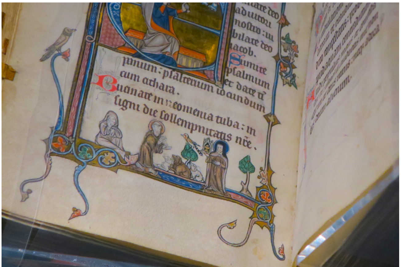
Detail of a circa 1275-1300 French psalter (and office of the dead) depicting St. Francis preaching to the animals and St. Clare holding a monstrance, on view