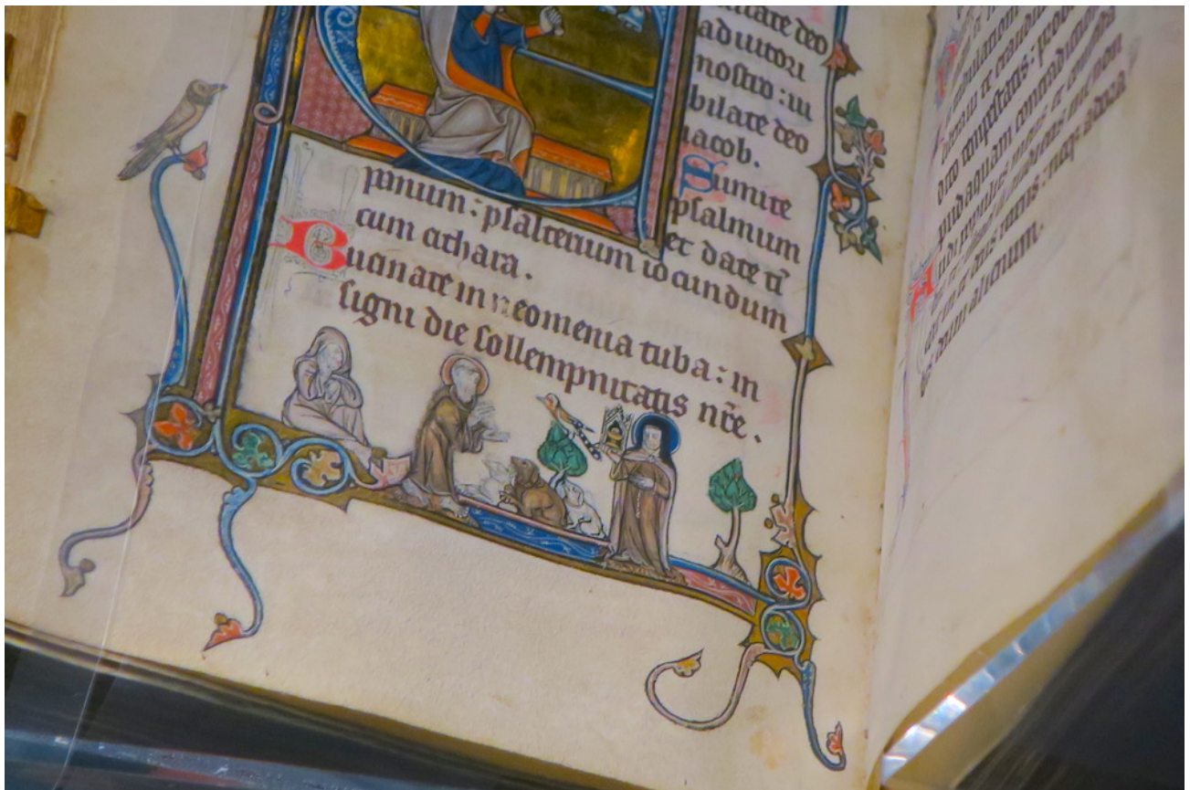
Detail of a circa 1275-1300 French psalter (and office of the dead) depicting St. Francis preaching to the animals and St. Clare holding a monstrance, on view