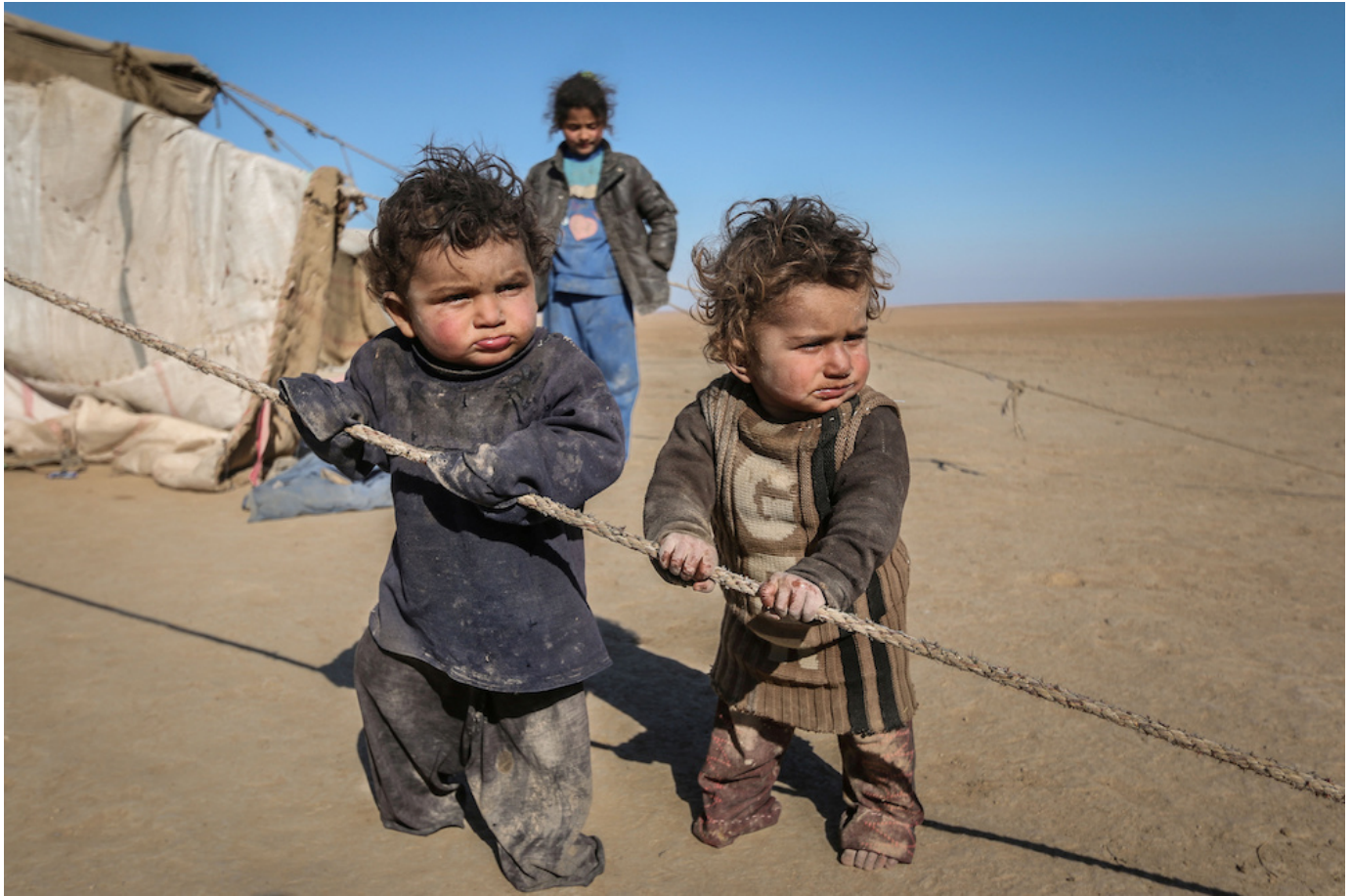
Internally displaced Syrian children who fled Raqqa city stand near their tent in Ras al-Ain, Syria, Jan. 22, 2017.