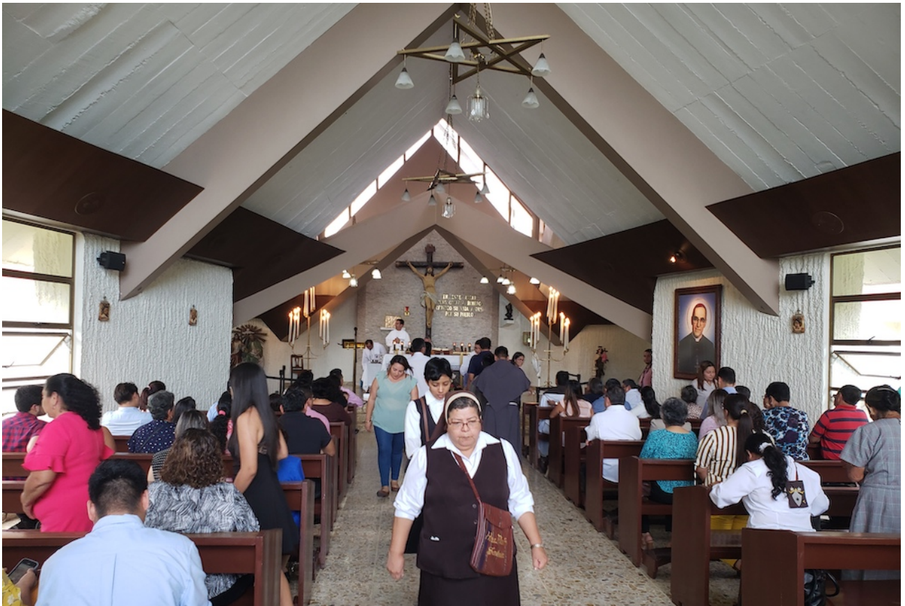
A chapel service takes place at the Hospital de la Divina Providencia, where St. Óscar Romero lived and where he celebrated his last Mass on March 24, 1980.

"He would see gang members as humans meant to be loved and that what they are doing [in committing crimes] is due to the lack of love in their hearts," she said. "I think Romero would say, 'You are people who need love, but you need to stop hurting and killing people.' "