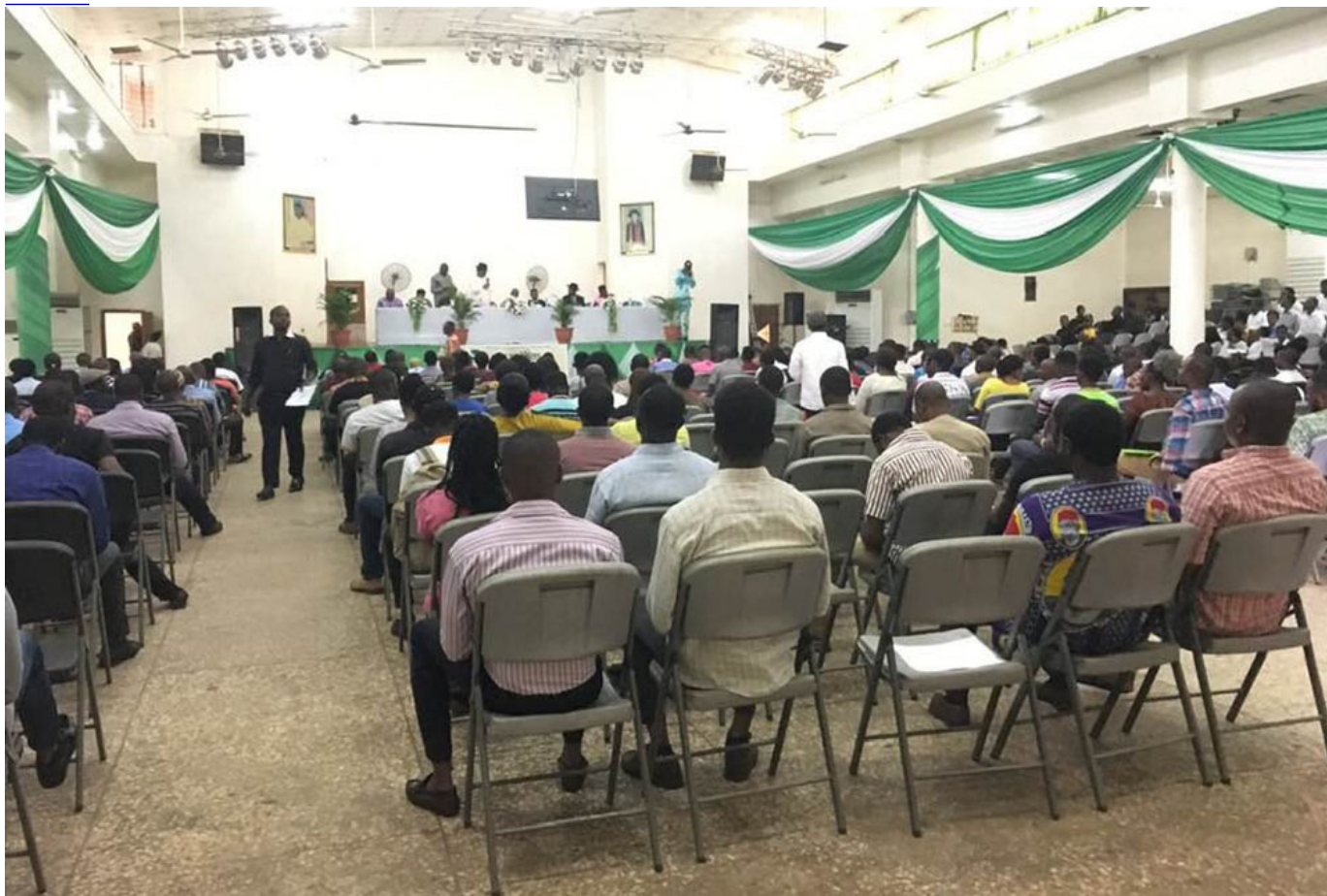
Participants at the witchcraft conference at the University of Nigeria, Nsukka, in November 2019