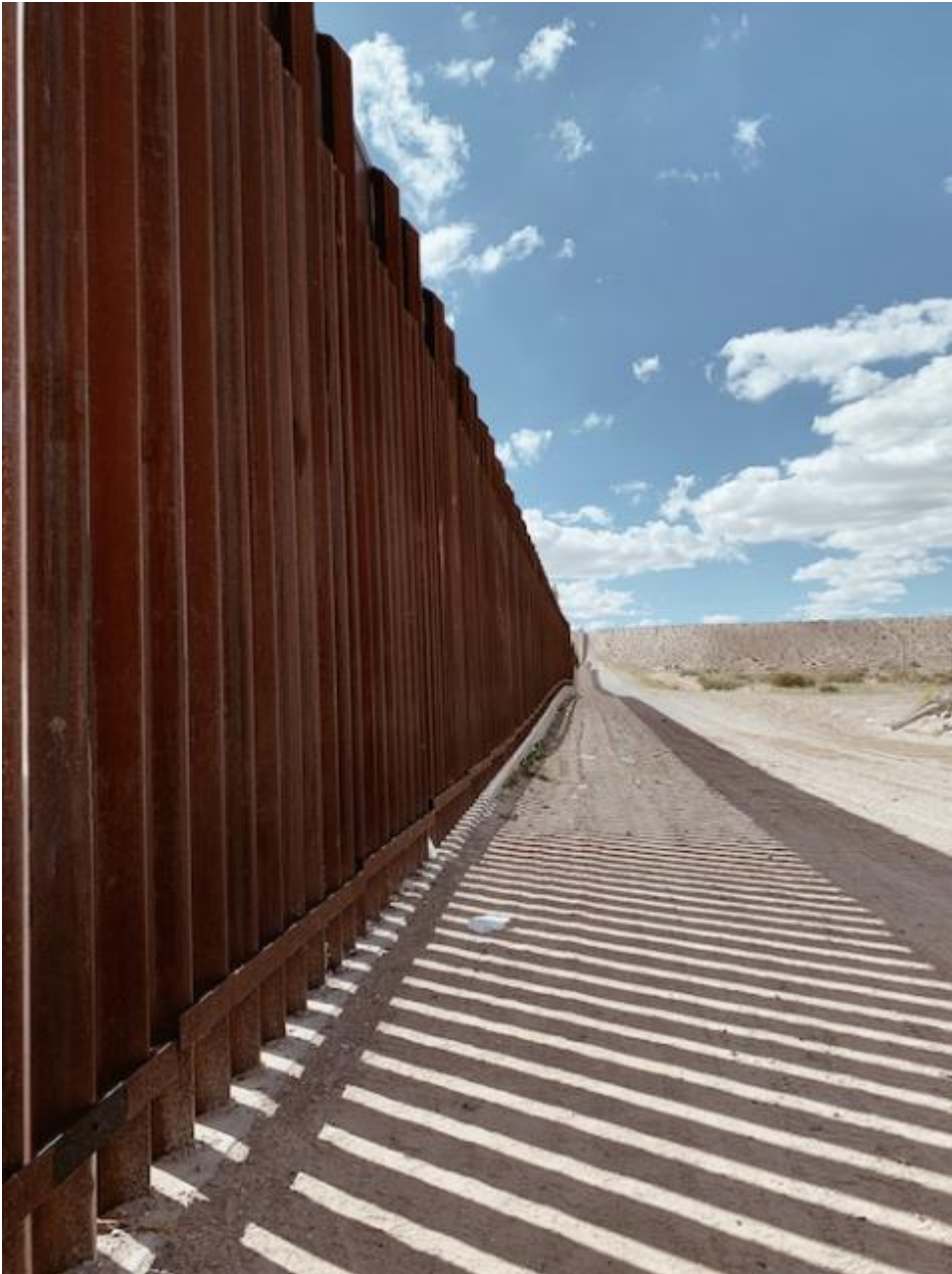
The border wall in Anapra, New Mexico (Celine Reinoso)

Before I moved to El Paso, I was ignorant to the effects of Trump's language and changes in policy. I felt indifferent when the Department of Homeland Security announced slight changes in the asylum-seeking process. I knew children were sleeping in cages or in tents on the streets of Mexico, but I felt so far away from the issues that no effort of mine would make a difference. I stopped reading the news because it was only to learn about another policy from our administration that endangers marginalized communities. I removed myself from what I thought were unjust and inhumane situations, but really, I just stopped paying attention to lived