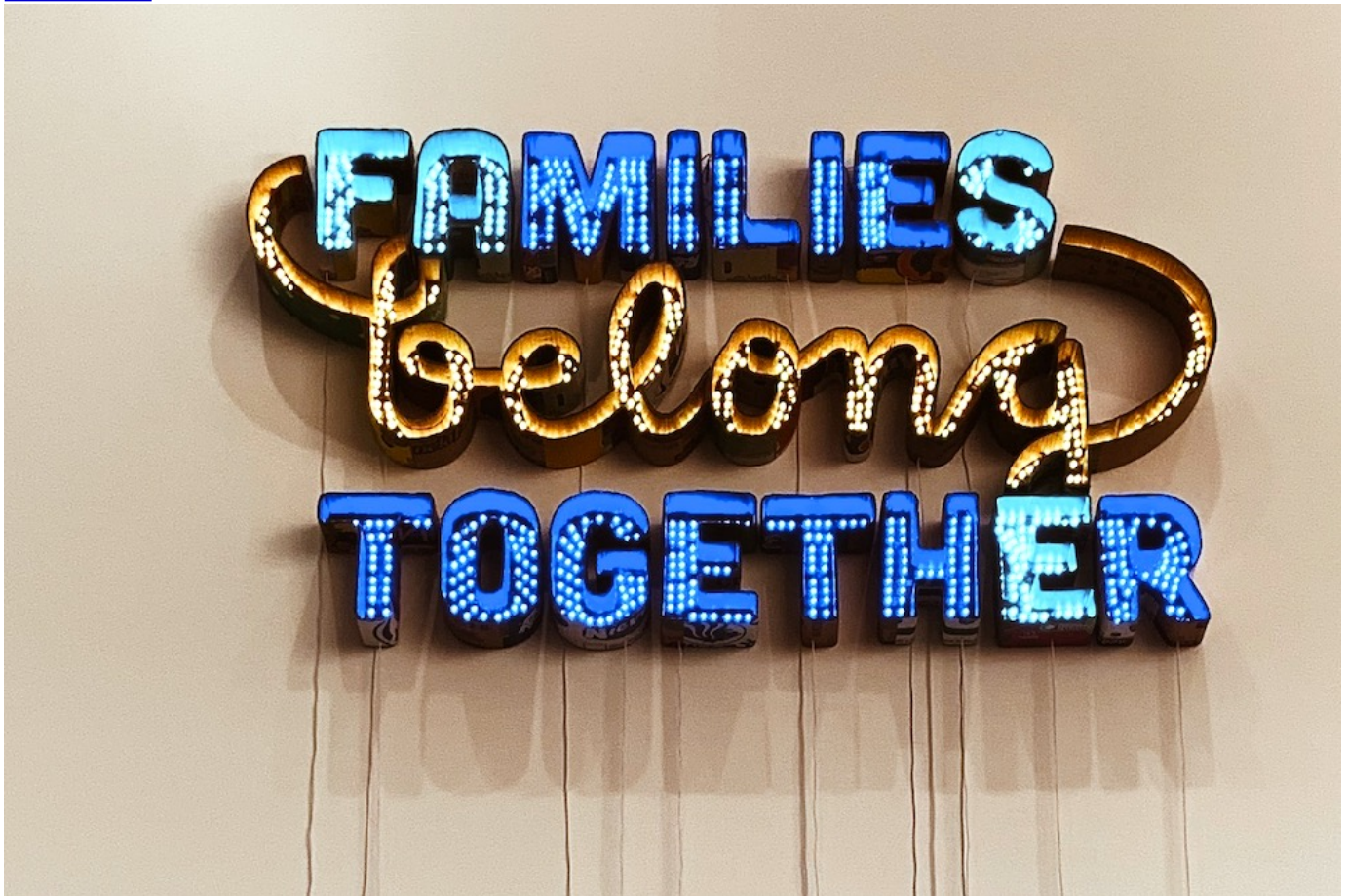
A light installation at the El Paso Museum of Art (Celine Reinoso)