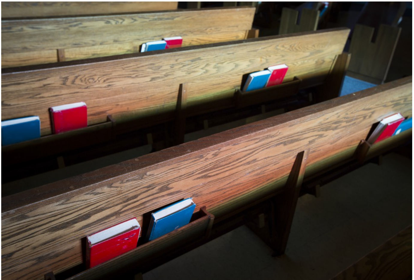
Pews are seen at St. Camillus Church in Silver Spring, Maryland, in 2018.