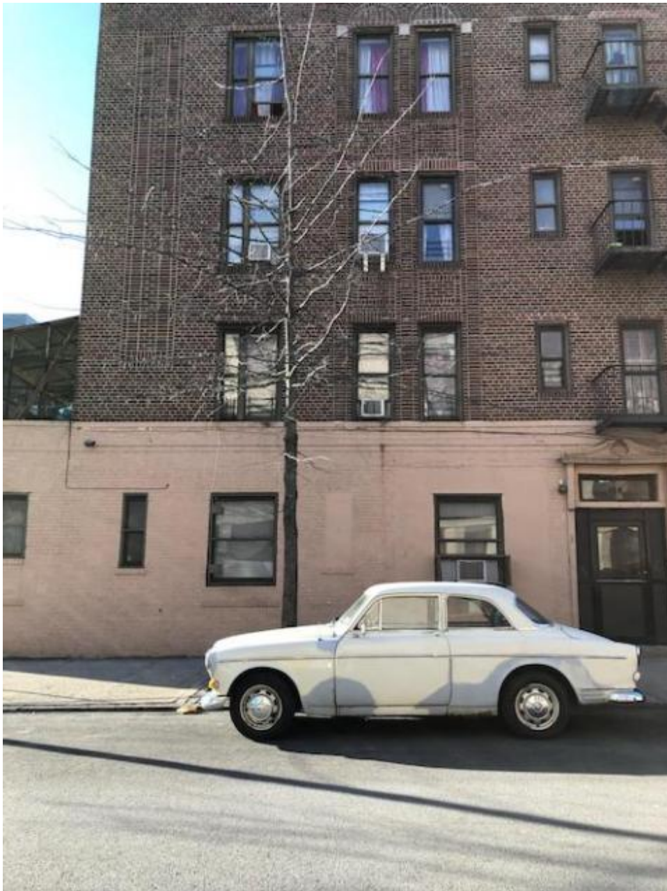
A midwinter day in the South Bronx

I didn't want to leave this life I had grown accustomed to. Here, I had again become captivated with Christ. I found him in the spiritual and material poverty. I found him in the face of the man selling roasted nuts in the square every evening. I found him in my children and our neighbors and the crossing guard who always made a point to smile and nod to me when I passed by. I had shed so many things in the Bronx, layers and layers of things that I identified as myself but really weren't me at all. I had given up running, piano, singing, comfortable living, relationships and so much more. Some of these skins were little, and some of them had wedged themselves