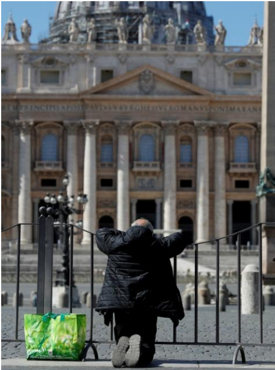
A man prays in front of an empty St. Peter's Square in Rome March 25.

For Catholics, the spring also brings the fifth anniversary of Pope Francis' social encyclical on ecology, " Laudato Si' , on Care for Our Common Home," with the Vatican sponsoring a weeklong celebration to rally the church to greater steps to care for God's creation.