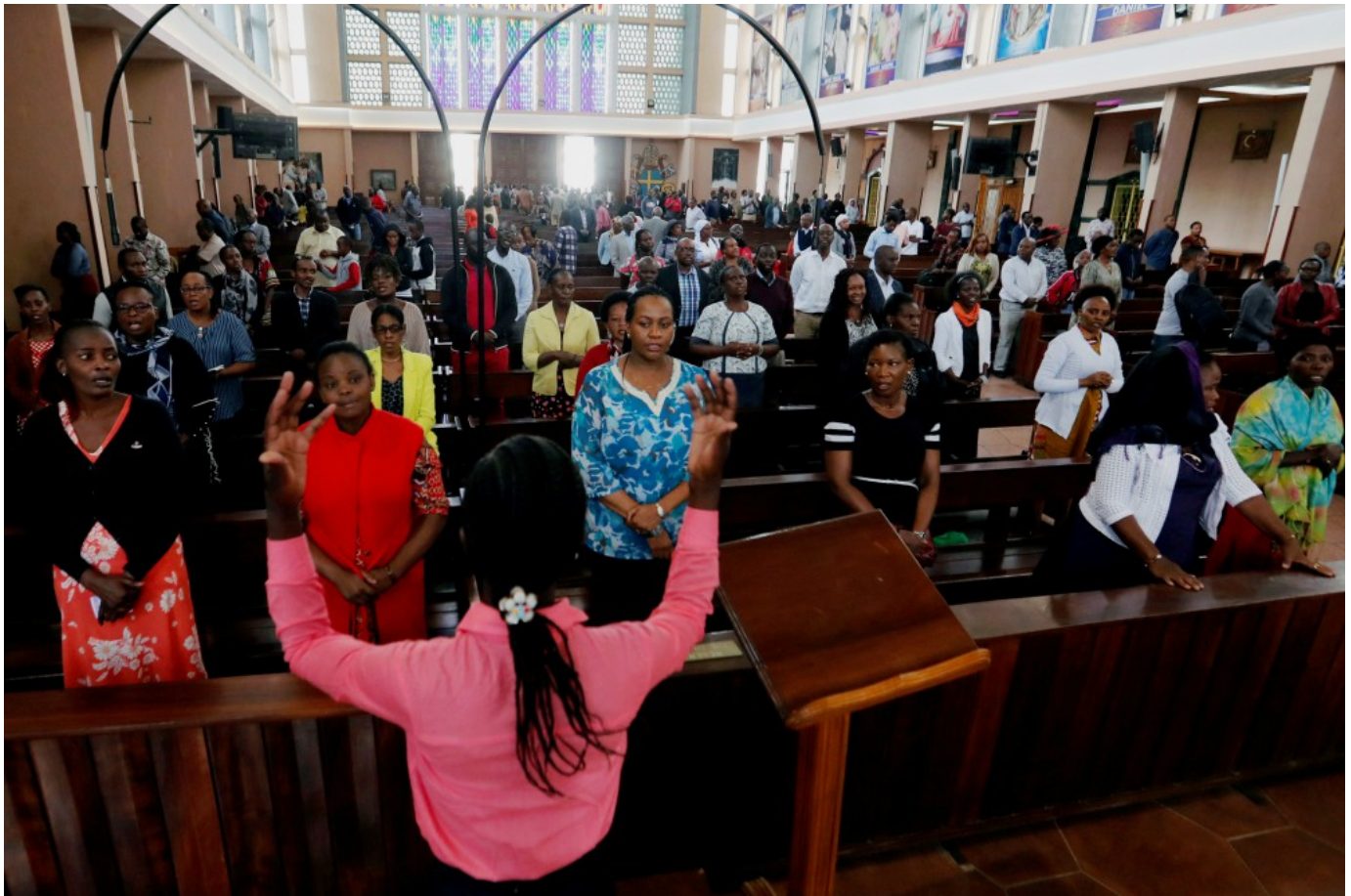
Worshippers pray during a Mass at the Cathedral Basilica of the Holy Family in Nairobi, Kenya, March 22, amid concerns about the spread of the coronavirus disease.

In Nairobi, where CYNESA is based, Ottaro said people are gradually realizing the seriousness of the virus. Watching it overwhelm health care systems in places like Italy and Spain have many worried how less-established systems in Africa will respond should the pandemic rise to similar levels there.