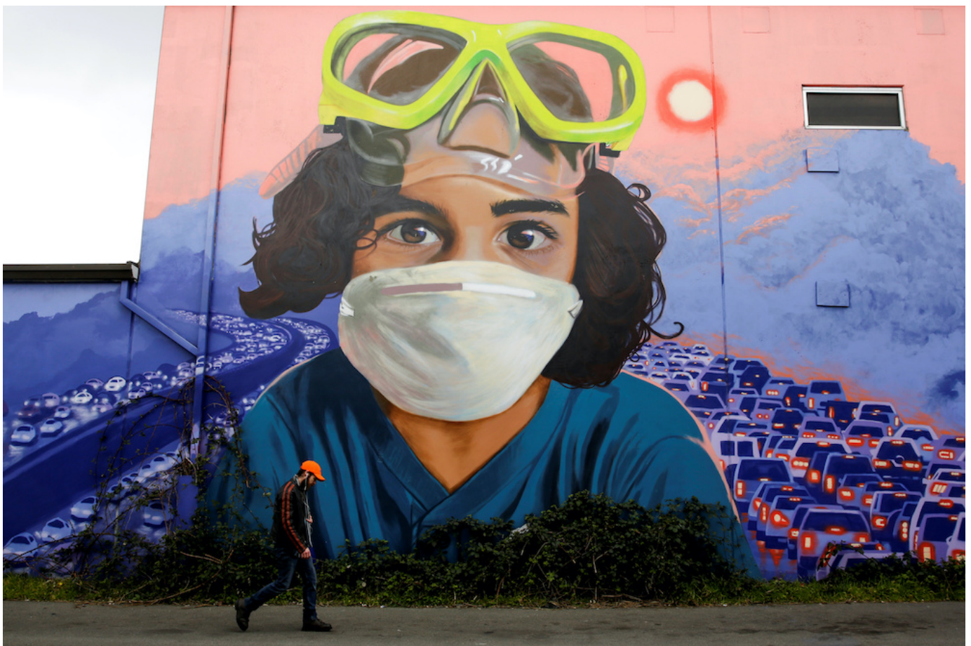
The mural in Seattle is seen during the coronavirus pandemic March 24.

Technology should enable us to reach out and advocate, both lovingly and effectively, on behalf of large portions of our faithful — Pope Francis' beloved peripheries — that previously have been ignored and underserved. It may take a new Marshall McLuhan to realize the best medium for these messages, but we must begin boldly today to craft the new forms of discourse that must be made available in this new pastoral climate.