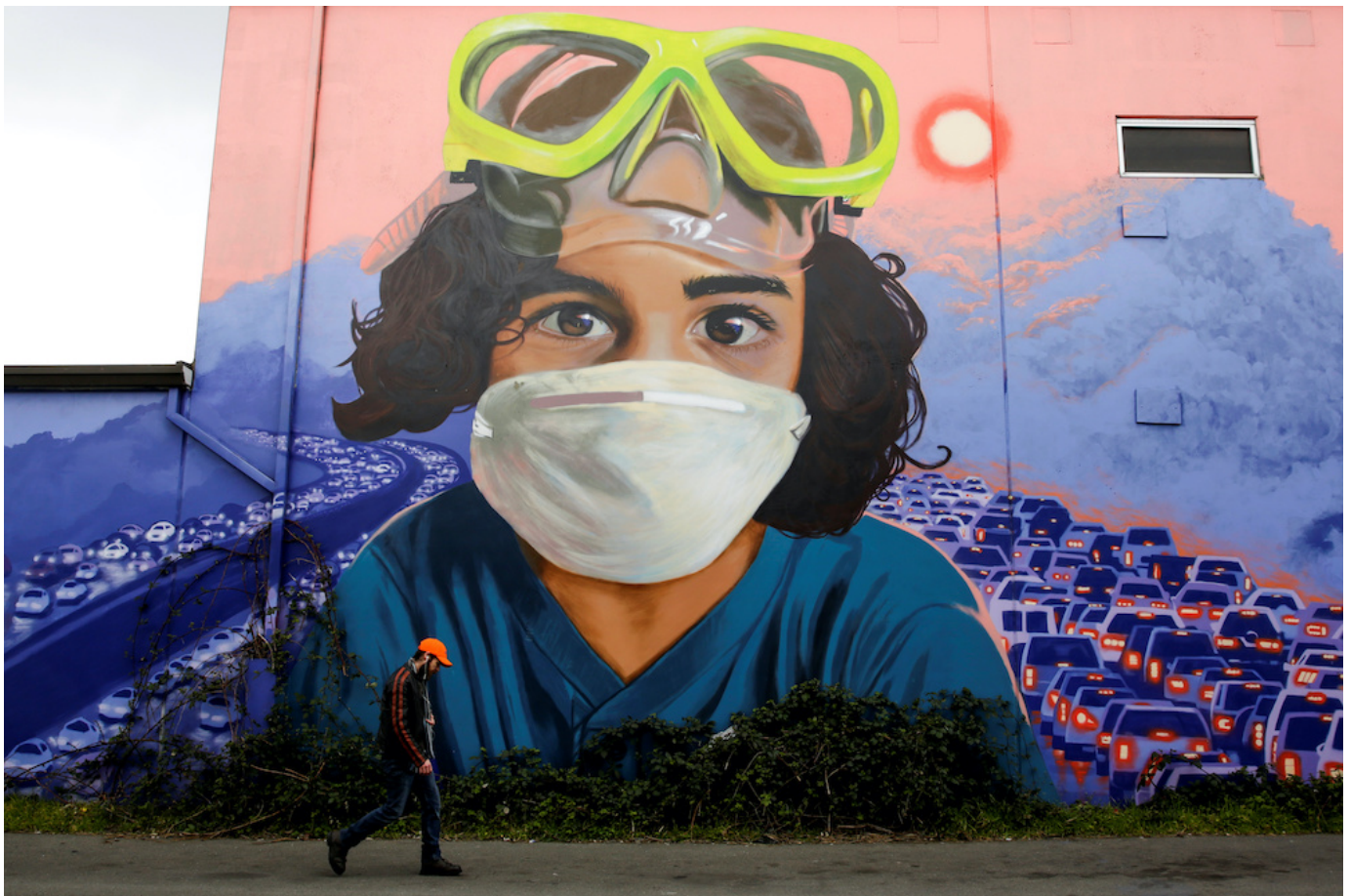
The mural in Seattle is seen during the coronavirus pandemic March 24.

Technology should enable us to reach out and advocate, both lovingly and effectively, on behalf of large portions of our faithful — Pope Francis' beloved peripheries — that previously have been ignored and underserved. It may take a new Marshall McLuhan to realize the best medium for these messages, but we must begin boldly today to craft the new forms of discourse that must be made available in this new pastoral climate.