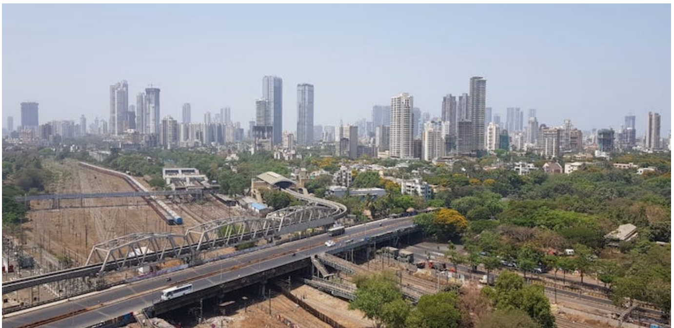
The view from Sameera Kahn's 17th floor apartment in Mumbai