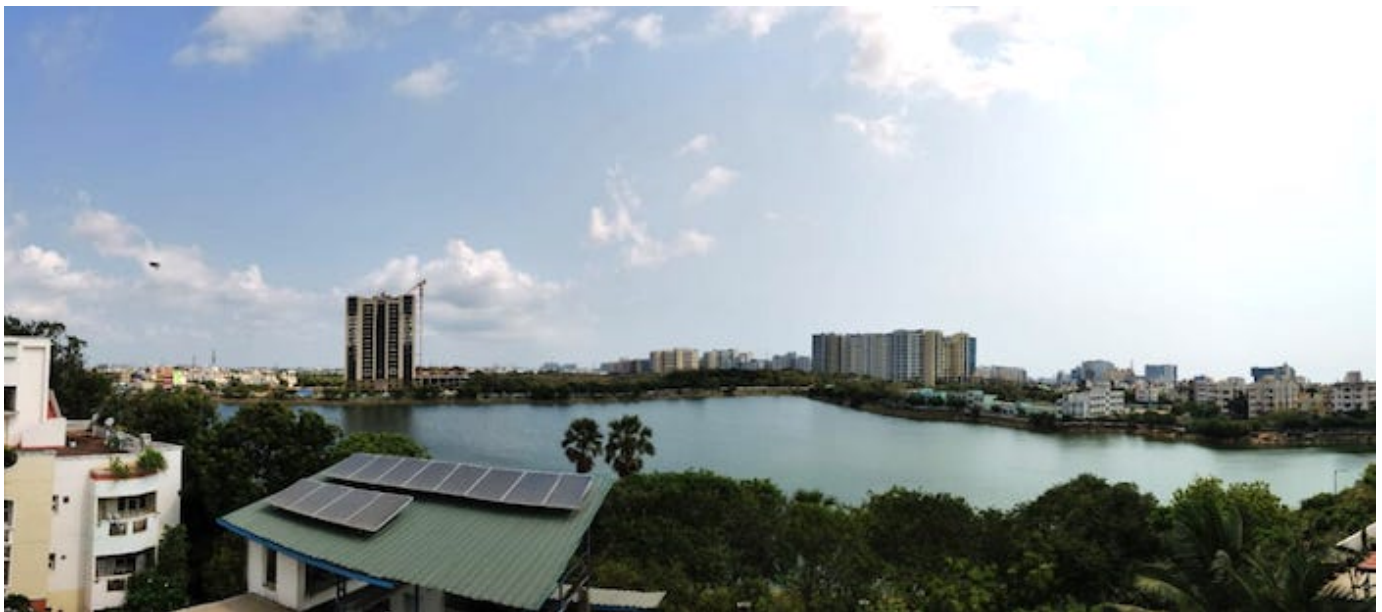
A view of Perungudi Lake, which serves as a reservoir in South Chennai (provided photo)

She added: "I am not sure whether we will learn the lessons we need from this and will actually make the... necessary changes after the Covid-19 crisis is over."