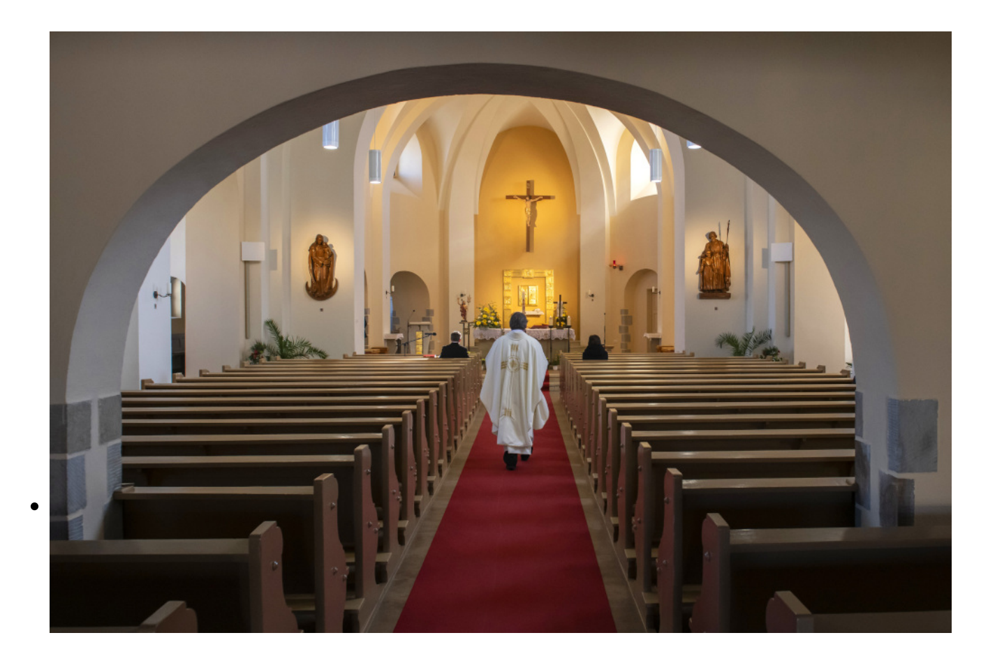
A Catholic priest, center, celebrates a mass in the empty Church of St. Catherine in Ralbitz, eastern Germany, April 12.