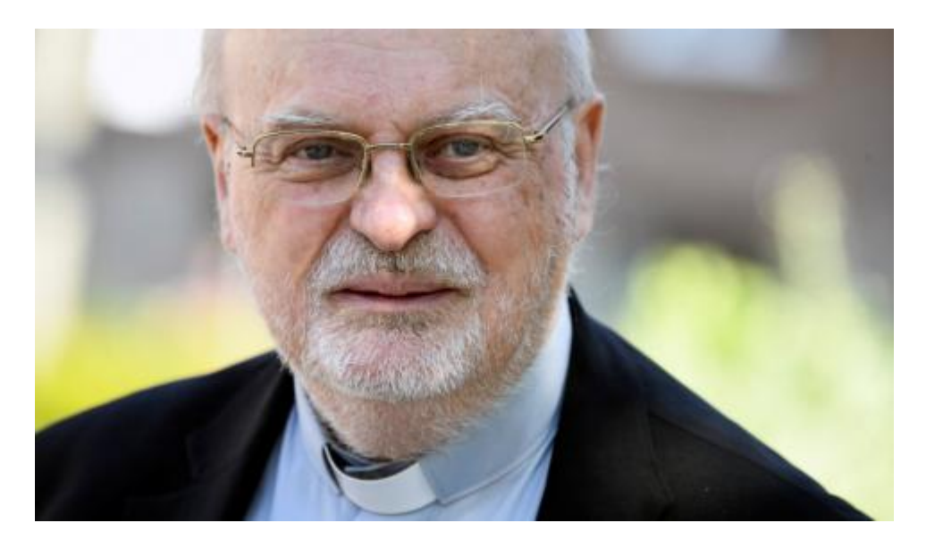
Cardinal Anders Arborelius of Stockholm is pictured in a 2017 file photo.

Unlike most countries, Sweden has chosen a more relaxed approach to preventing the spread of the coronavirus, sparking a debate on how governments should confront the deadly pandemic.