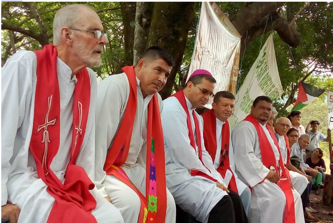
Priests from the Diocese of Chalatenango, El Salvador, including Bishop Oswaldo Escobar Aguilar, middle, gathered to celebrate Mass May 14, 2019, at the site of the Sumpul River massacre.