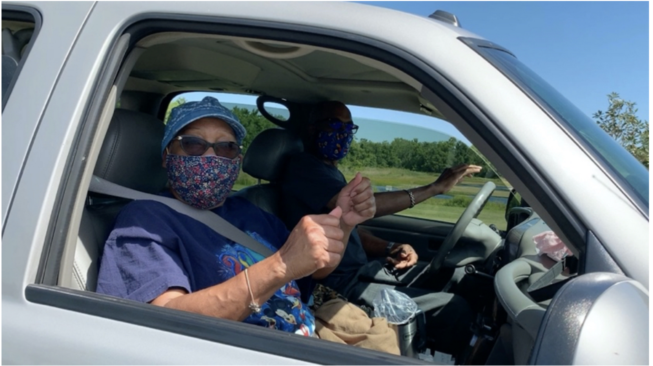
Two people who worked in transportation, bus driving, for a Disney park came to St. Rose of Lima food pantry May 8.