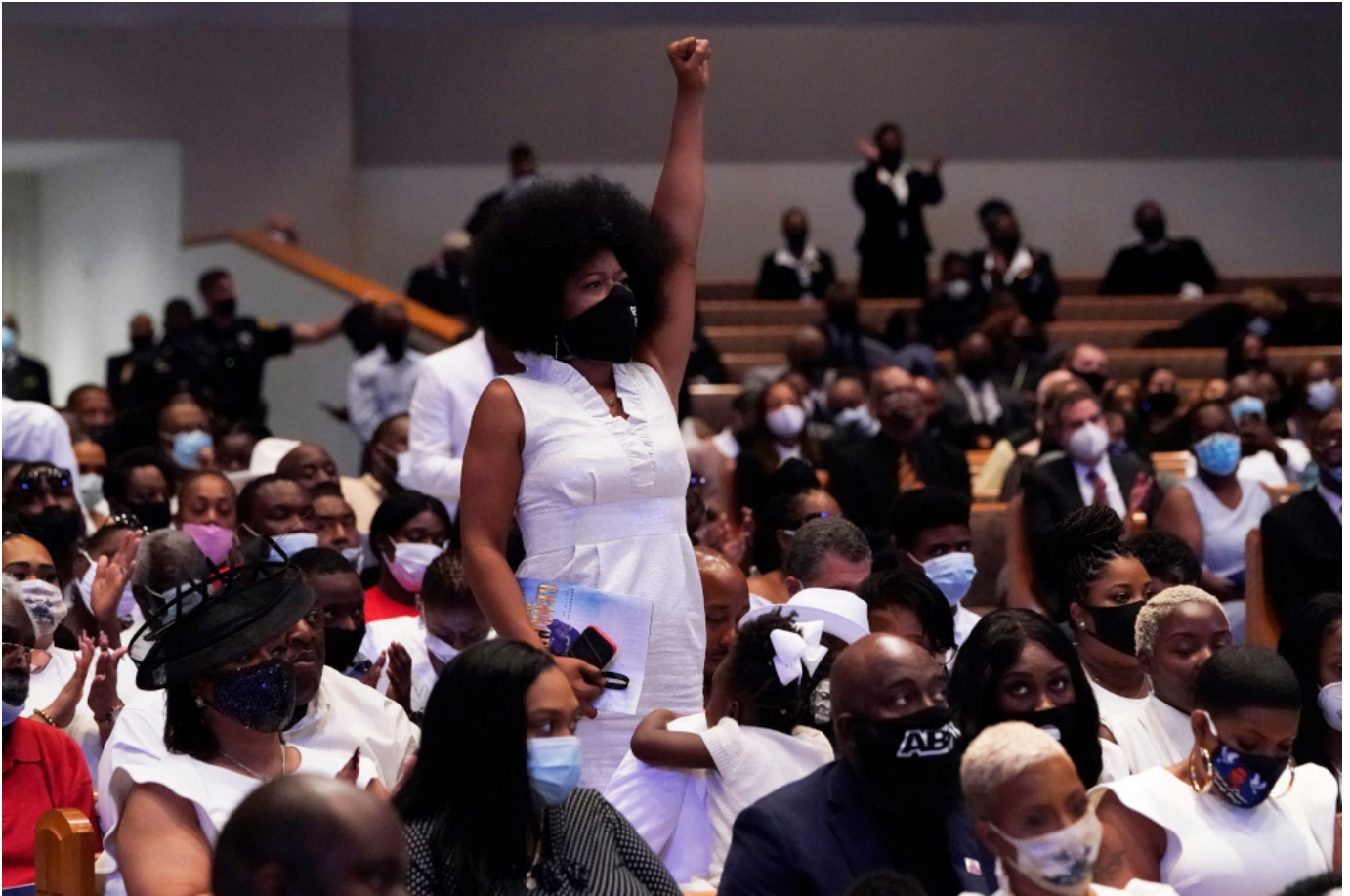
Family and guests attend the funeral service for George Floyd at The Fountain of Praise church Tuesday, June 9, 2020, in Houston.

"The president talks about bringing in the military, but he did not say one word about 8 minutes and 46 seconds of police murder of George Floyd," Sharpton said. "He challenged China on human rights. But what about the human right of George Floyd?"