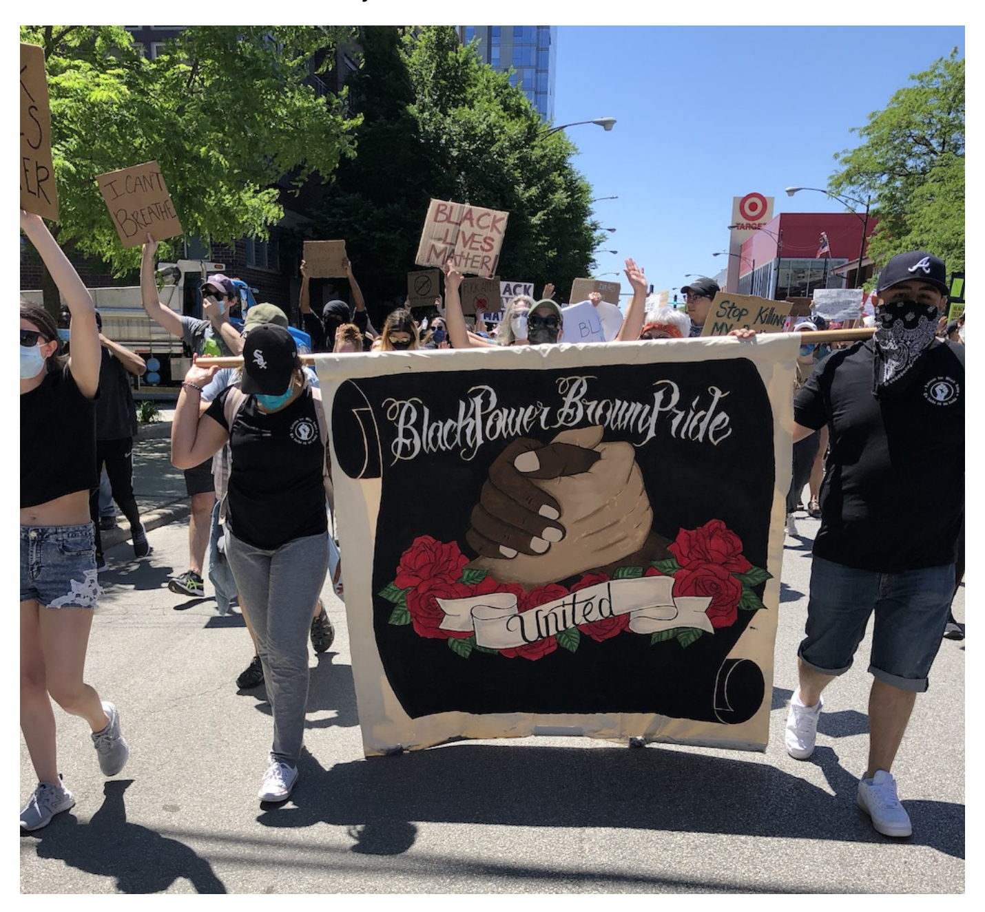
Over 30,000 protestors participate in a May 6 walk organized by Activate:Chi, a grassroots organization group based in Chicago.