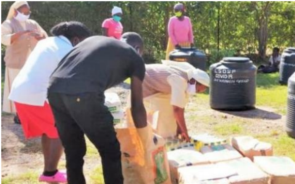
Little Sisters of St. Francis serve in solidarity with the poor and needy during the COVID-19 pandemic.

These practices have resulted in an increasing desire among the sisters for personal and institutional renewal. Members have become more vibrant in their apostolates. There is desire for specific growth practices such as special retreats, workshops (e.g., about family trees), Franciscanism and knowledge of Mariology.