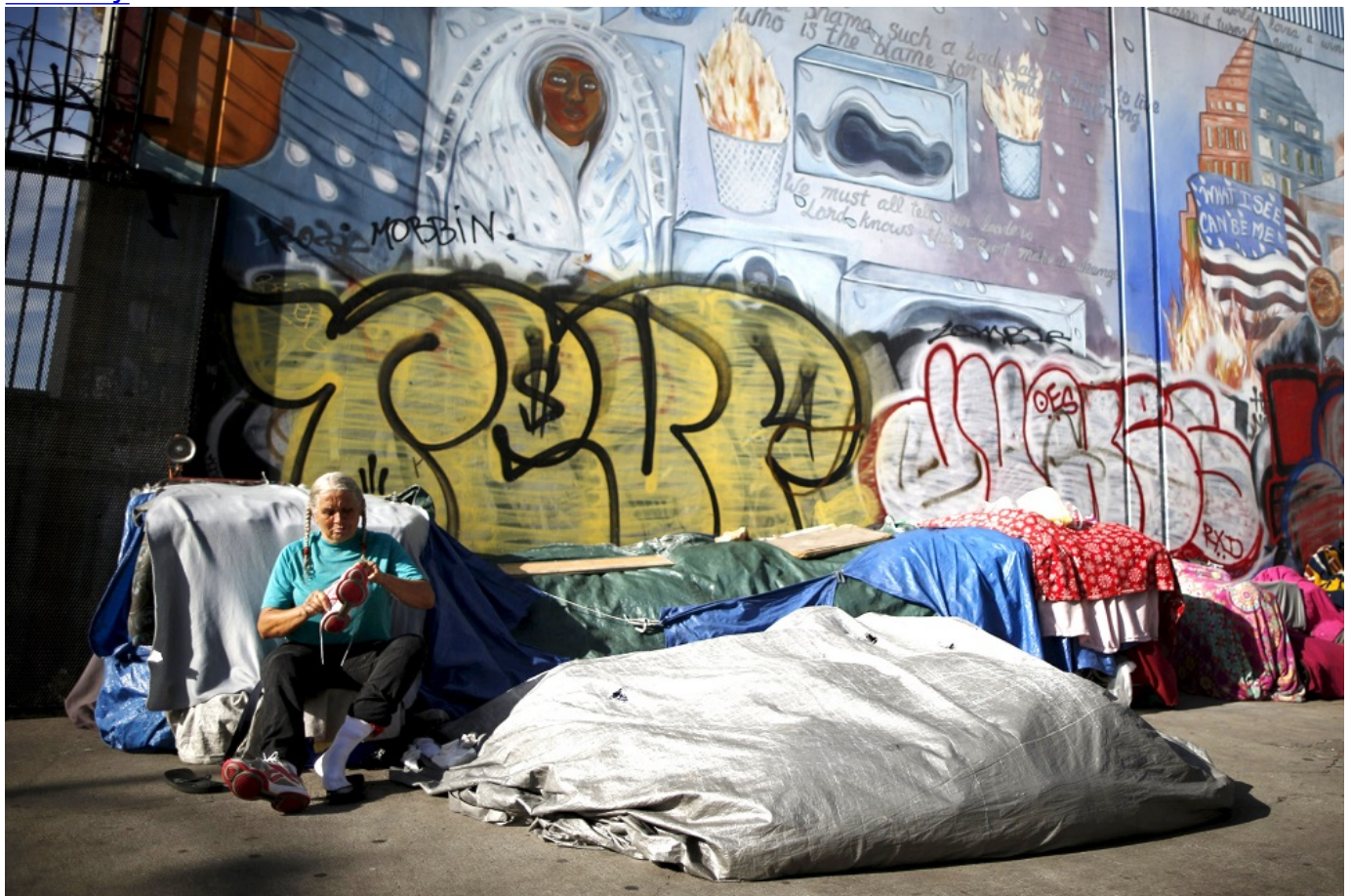
A woman sits outside her tent on Skid Row in downtown Los Angeles in 2015.