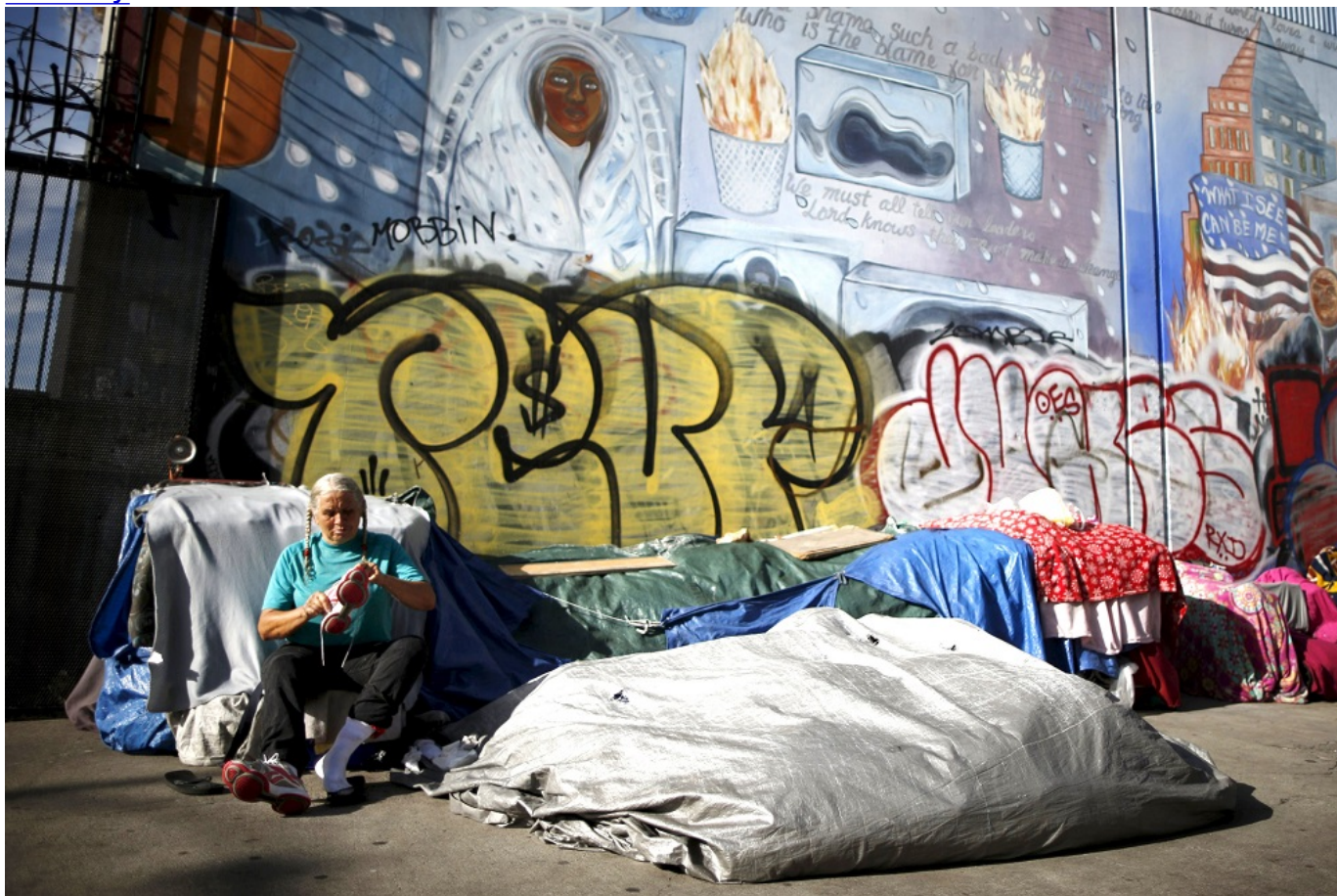
A woman sits outside her tent on Skid Row in downtown Los Angeles in 2015.