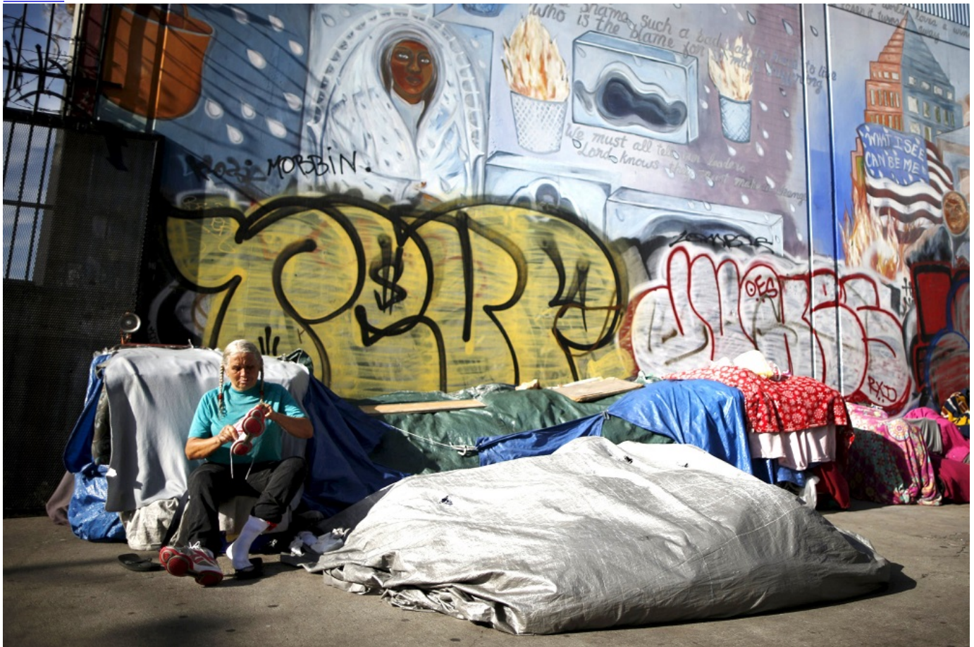
A woman sits outside her tent on Skid Row in downtown Los Angeles in 2015.