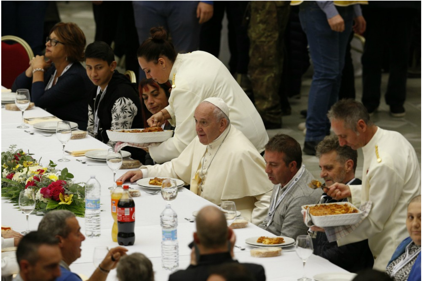
Pope Francis eats lunch with the poor in the Paul VI hall as he marks World Day of the Poor at the Vatican Nov. 17, 2019.