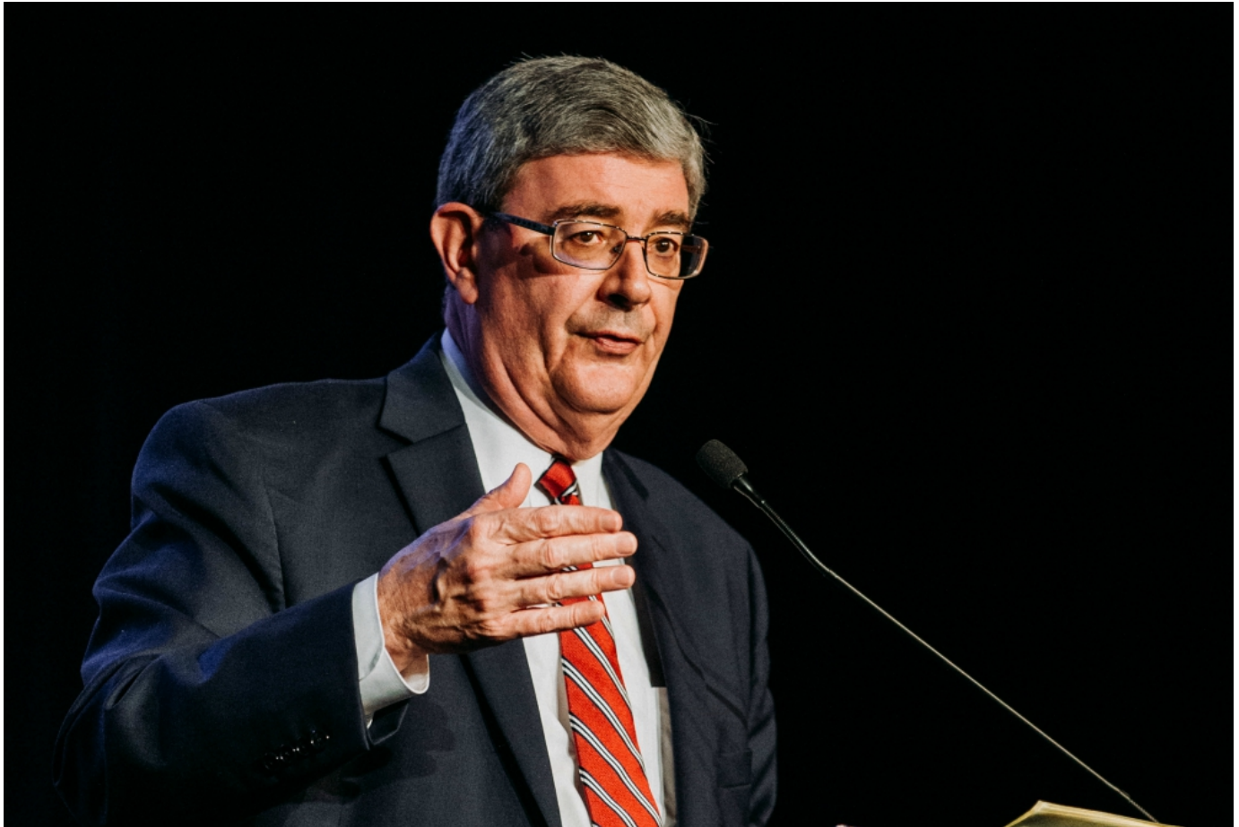
George Weigel speaks July 25, 2019, at the Napa Institute's annual Summer Conference in California.

I can picture the marketing folks at Ignatius coming up with the brilliant idea to send the book to all 222 of the world's cardinals. Or was it Dolan's idea? And, more importantly, who paid for the books? Did anyone stop to think how this might be perceived? Or did they not care?