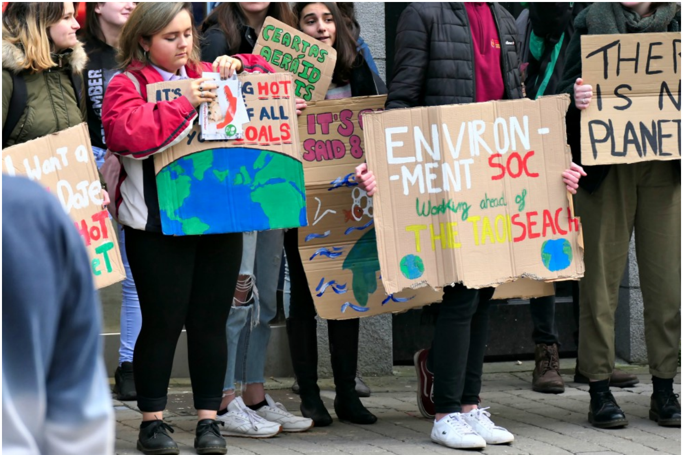
Climate activists demonstrate on a street in the city of Galway, Ireland, in an undated file photo.

He described the central theme of his book as integral ecology.