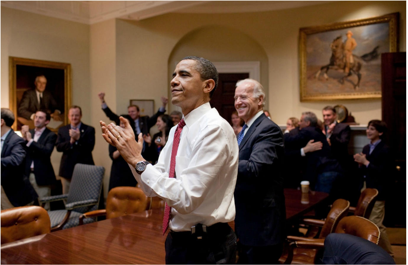
President Barack Obama, Vice President Joe Biden and senior staff react in the Roosevelt Room of the White House as the House passes the health care reform bill March 21, 2010.