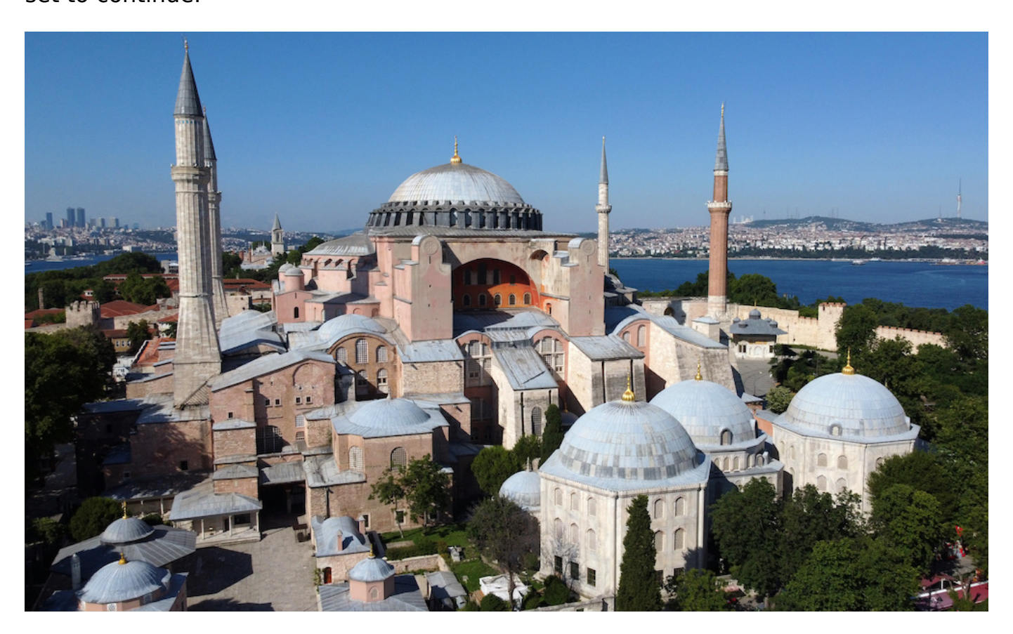
Hagia Sophia is seen in Istanbul June 30, 2020.

For now at least, the storm over this ancient Bosphorus landmark, now echoing daily with five Muslim prayer services, led by three official imams and five muezzins, looks set to continue.