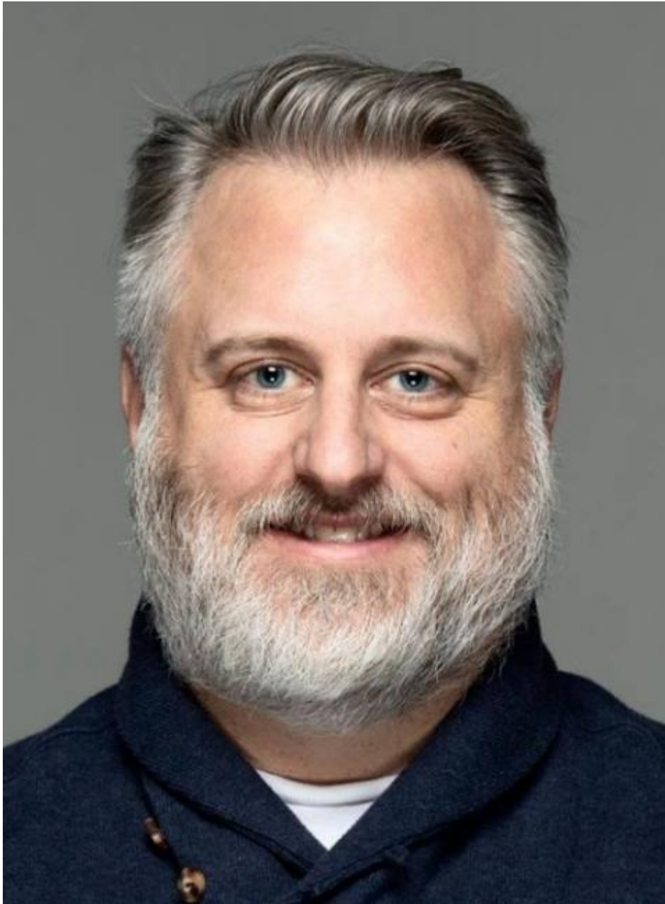
Hank Stuever (The Washington Post)