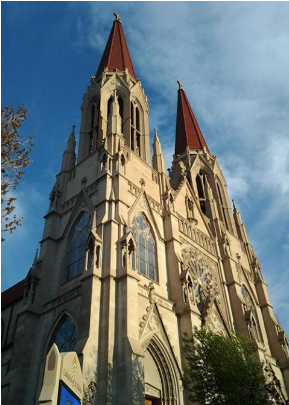
The Cathedral of St. Helena in the Diocese of Helena, Montana