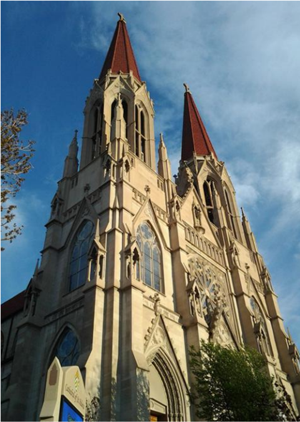
The Cathedral of St. Helena in the Diocese of Helena, Montana