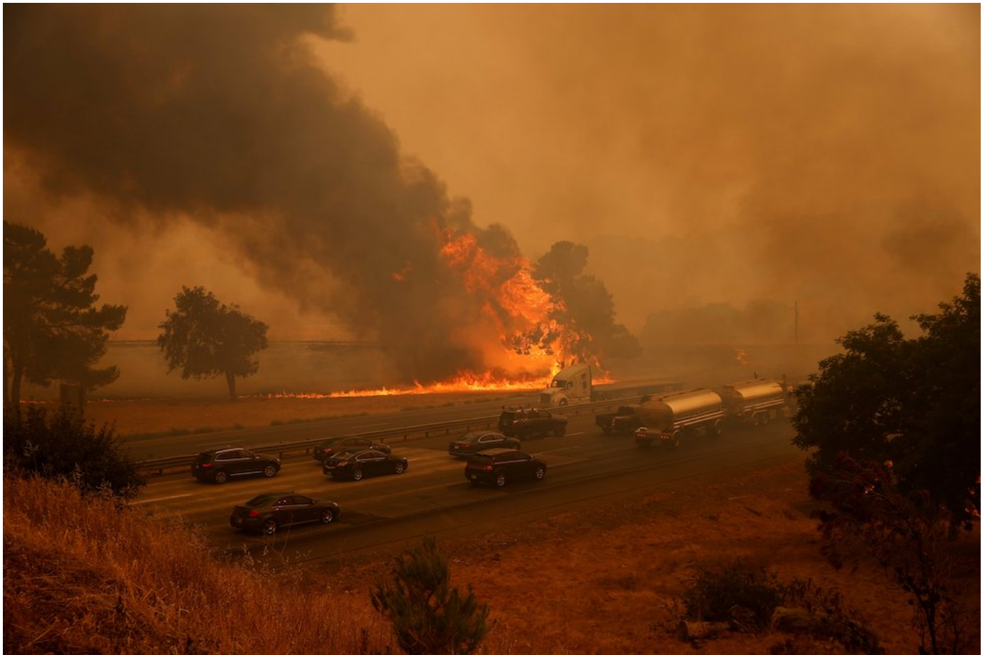
Flames from the LNU Lighting Complex Fire are seen along Interstate 80 near Vacaville, California, Aug. 19.

Biden's proposals on environmental issues, becoming bolder with his ascent to the nomination, have regularly come back to two words: jobs and justice. That focus has galvanized support from a broad coalition that includes environmental groups, unions, faith communities and people living with the daily reality of pollution in their neighborhoods.