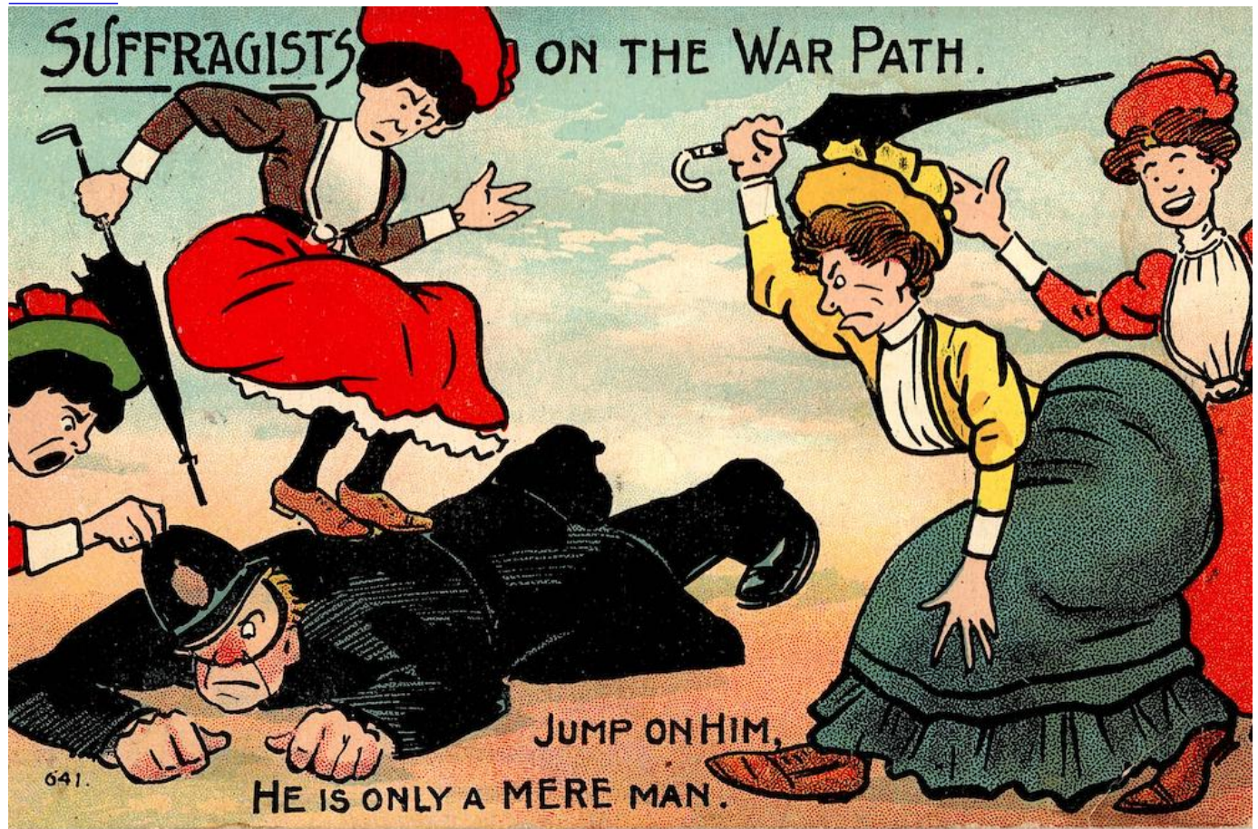
Anti-suffrage postcard