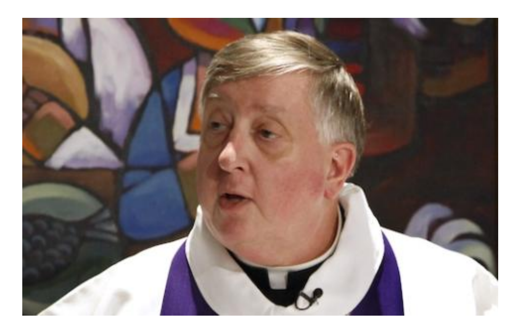
Bishop Mitchell Rozanski during a March 2, 2017, prayer service in Chicago