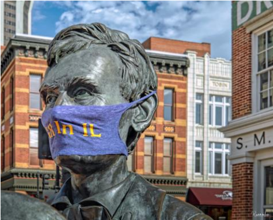
Statue of President Abraham Lincoln with "All in Illinois" mask, Springfield Old State Capitol Plaza, April 8

offences which, in the providence of God, must needs come, but which, having continued through His appointed time, He now wills to remove."