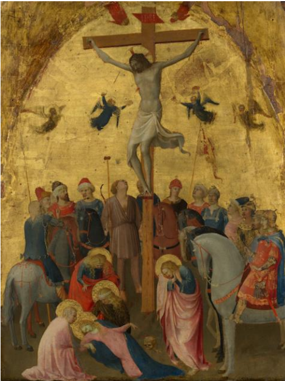
Detail of painting "The Crucifixion" by Fra Angelico (Guido di Pietro), circa 1420-23 (Metropolitan Museum of Art)

But this type of thinking has percolated in Catholic circles for a while. Couples who opt to use natural family planning (or NFP), and find it difficult or damaging, are often admonished for failure of faith — just as Deacon Poyo accused those who have been taking precautions of "living in fear."