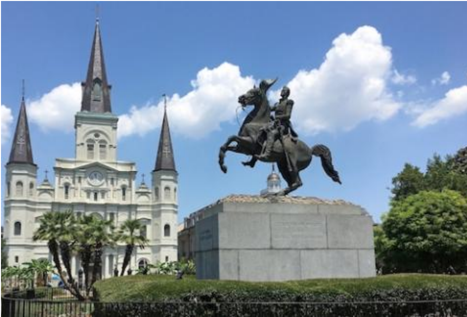
The Cathedral-Basilica of St. Louis King of France and a statue of Andrew Jackson in New Orleans June 3, 2019