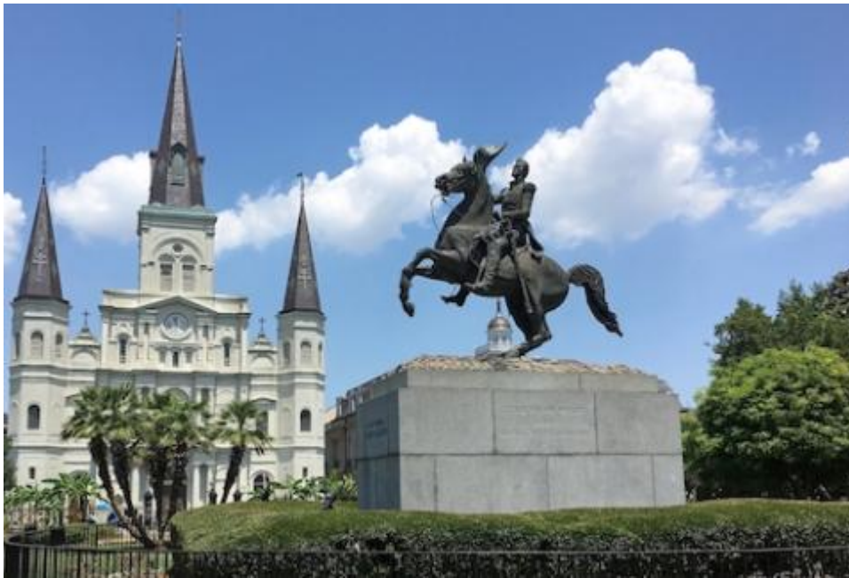
The Cathedral-Basilica of St. Louis King of France and a statue of Andrew Jackson in New Orleans June 3, 2019