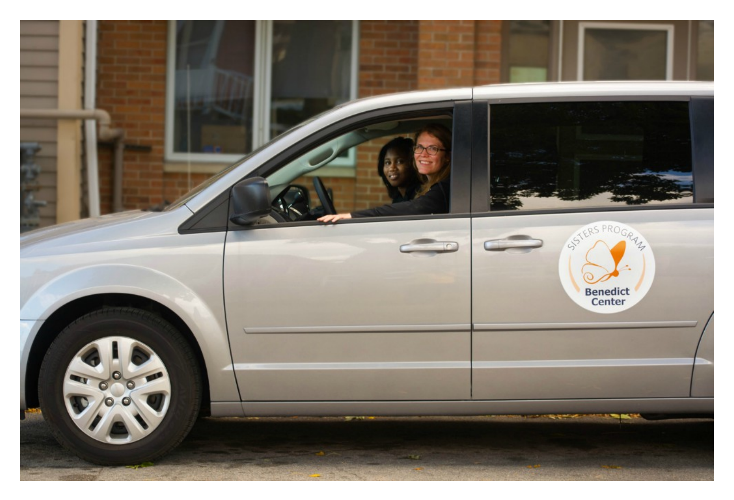
Impact 100 Greater Milwaukee provided funds for purchasing the Sisters Program van.

<u>Hope House</u>, an organization providing programs for families, has graciously rented us some space that includes a small kitchen, showers, a dedicated sleeping area with comfortable beds, a dining/living room area, offices and meeting room areas. Even though our location is on Milwaukee's south side, our space and services are available for women anywhere in the city. <u>Impact 100 Greater Milwaukee</u> provided funds for purchasing the Sisters Program van.