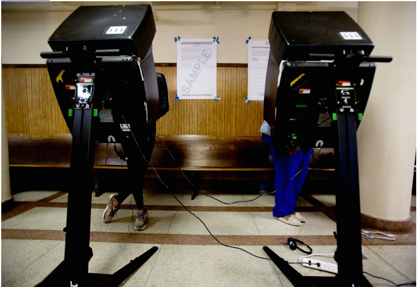
People vote in the John Bailey Room at St. Francis Xavier Church in Washington, D.C., Nov. 8, 2016.