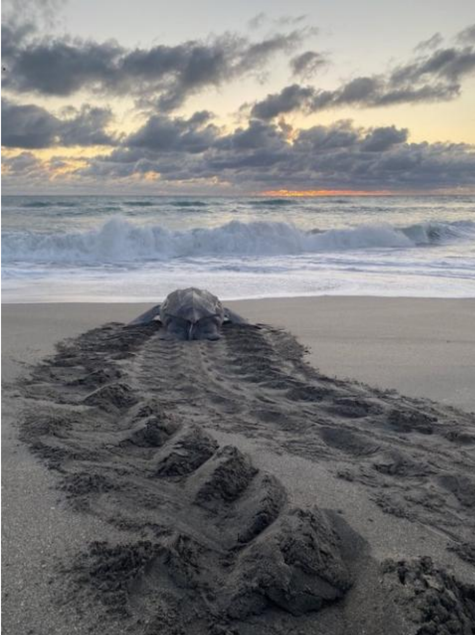
A leatherback sea turtle, " Dermochelys coriacea ," returns to the water after nesting, May 7, 2014

clutch of eggs. They would carefully check the nest and erect the orange plastic tape "fence" around it with stakes bearing a code for each species â?? not to be revealed lest poachers figure it out â?? and signs warning against disturbing the nests. Penalties under Florida law can include 60 days in jail and a $500 fine, plus an additional $100 for each egg destroyed or taken. The federal Endangered Species Act allows sanctions of up to a year in prison, civil fines of $25,000 or criminal penalties of $100,000.