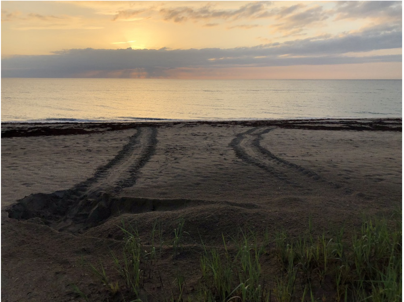
Turtle tracks lead back to the water from a pair of green sea turtle, "Chelonia mydas," nests, July 9, 2020.

A drive along coastal highway A1A clearly shows the tougher development restrictions in Martin County, which limited the density and height of buildings and required set-asides for plenty of public-access beaches, compared with the towering condos and more limited beach access in St. Lucie County. Members of my family settled in Martin County more than 40 years ago, and I lived and reported in the region for The Miami Herald in the mid-80s during my decades-long stint as a journalist in South Florida before moving to the Washington, D.C., area in 2011. Over the years, I've witnessed the increasing development, which is why it was reassuring that the sea turtles were also claiming their part of the beach.