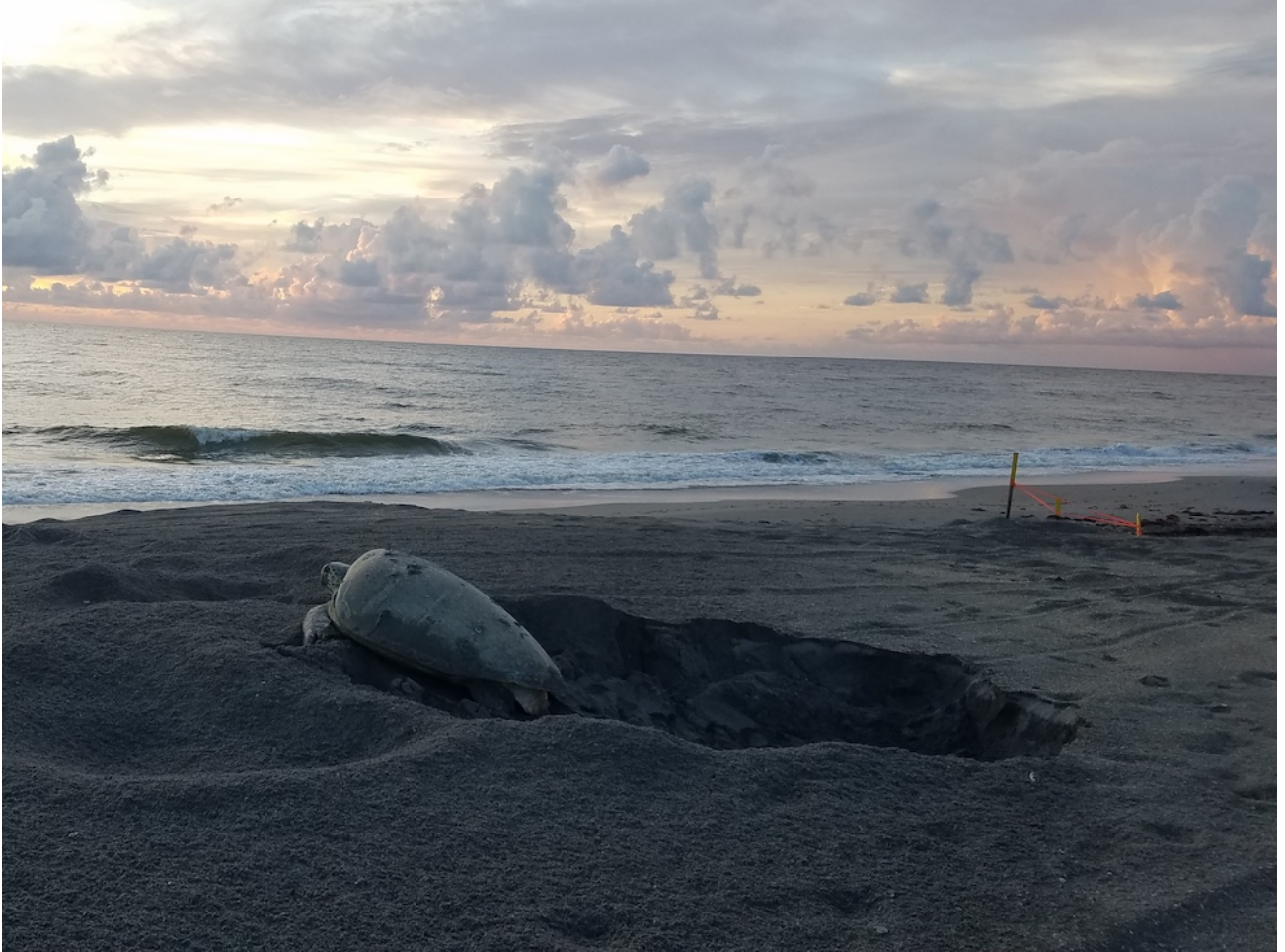
A green sea turtle, " Chelonia mydas ," heads back to the water after nesting, June 14, 2020.

A sea turtle nest is marked by orange tape to protect it from beachgoers. Helped by conservation measures, monitoring and research, sea turtles are still nesting along Florida beaches despite development pressures.