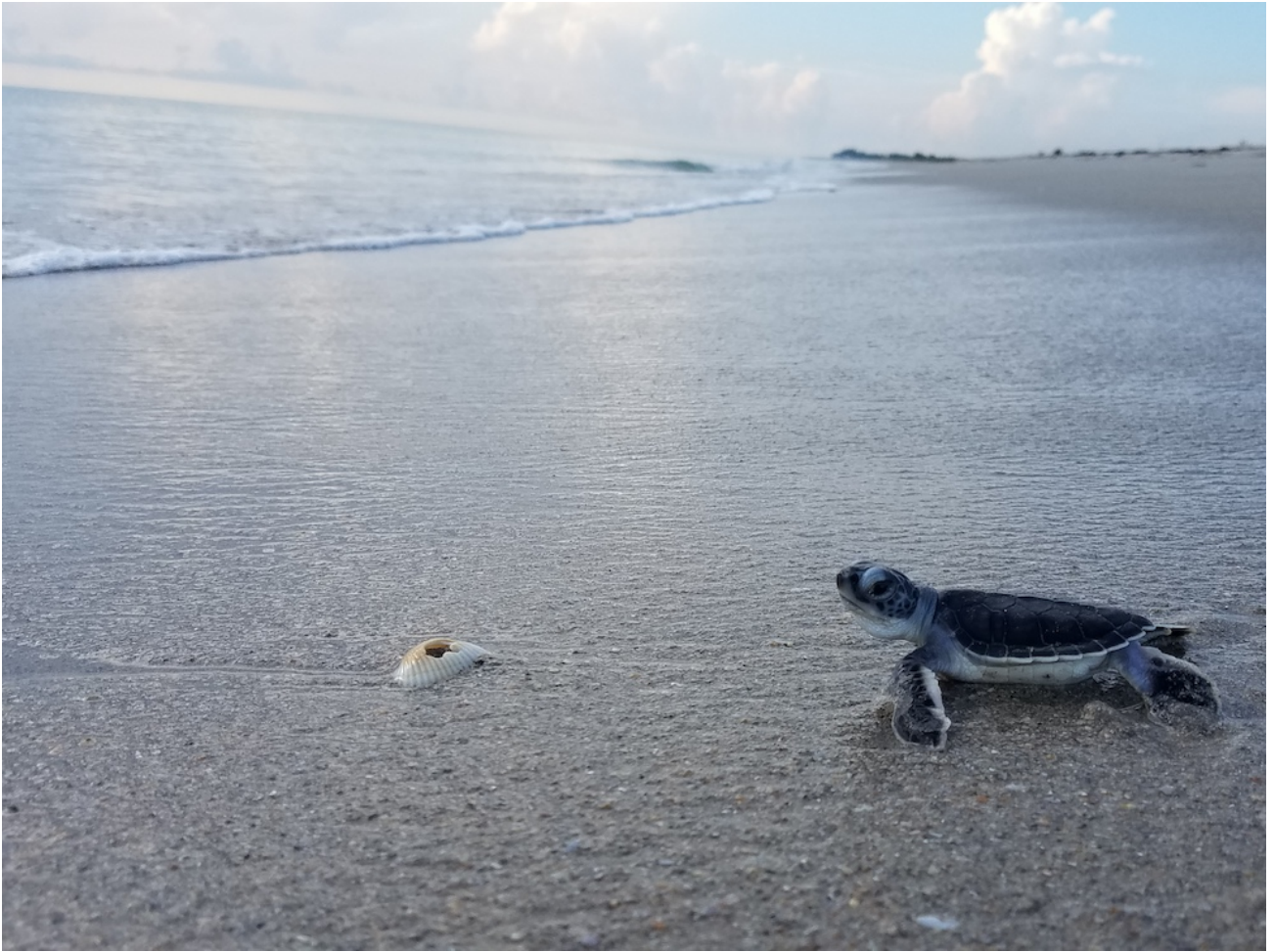
A green sea turtle hatchling, " Chelonia mydas ," Aug. 30, 2020