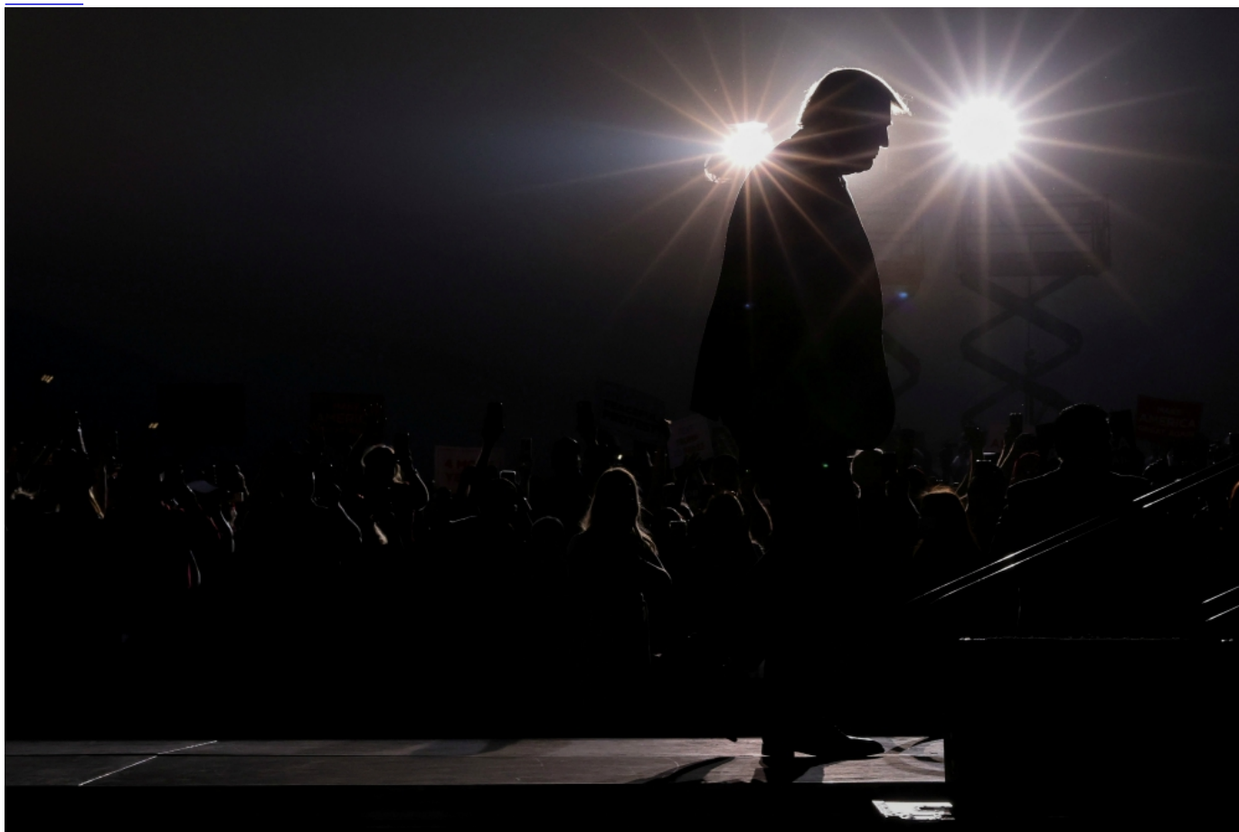
President Donald Trump is seen at a campaign rally in Reno, Nevada, Sept. 12.