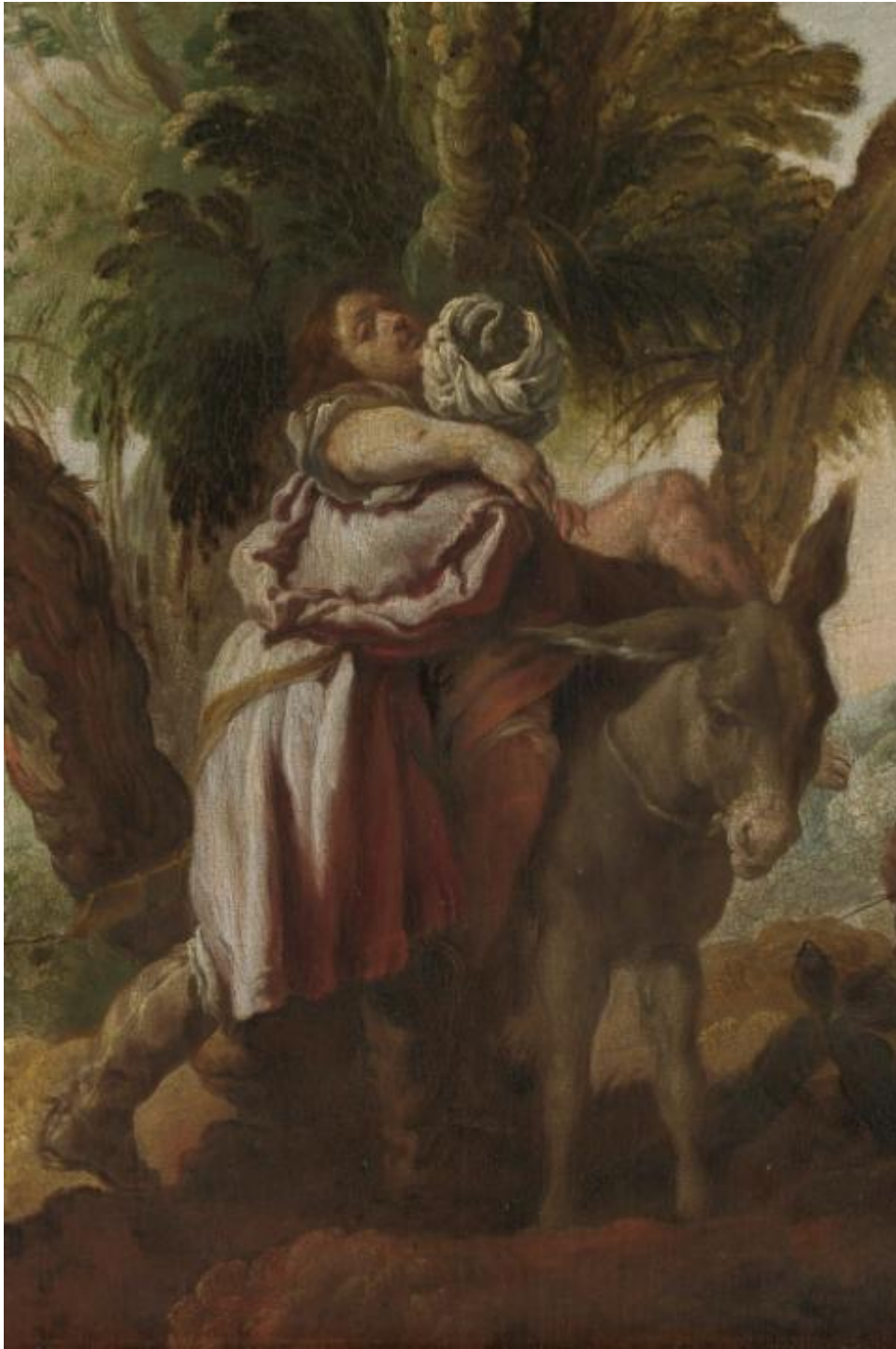
"The Good Samaritan" (circa 1618-22, detail), attributed to Domenico Fetti (Metropolitan Museum of Art)

The parable of the good Samaritan provides an alternative. It lays out clear, positive moral obligations to our neighbor, including those who, in one way or another, are distant. As Francis notes in the encyclical's second chapter, "Certainly, he had his