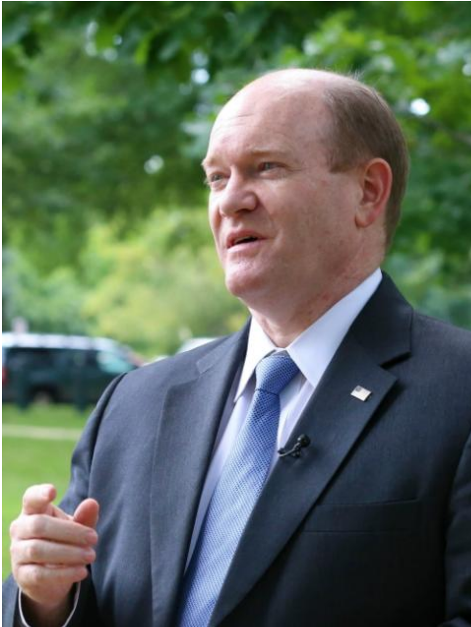
Sen. Chris Coons

Coons added that the faith community "can lift up the urgency" of the long-term consequences of climate change, "which is imminent and present in the experiences of so many around the world here in the short term, as well."