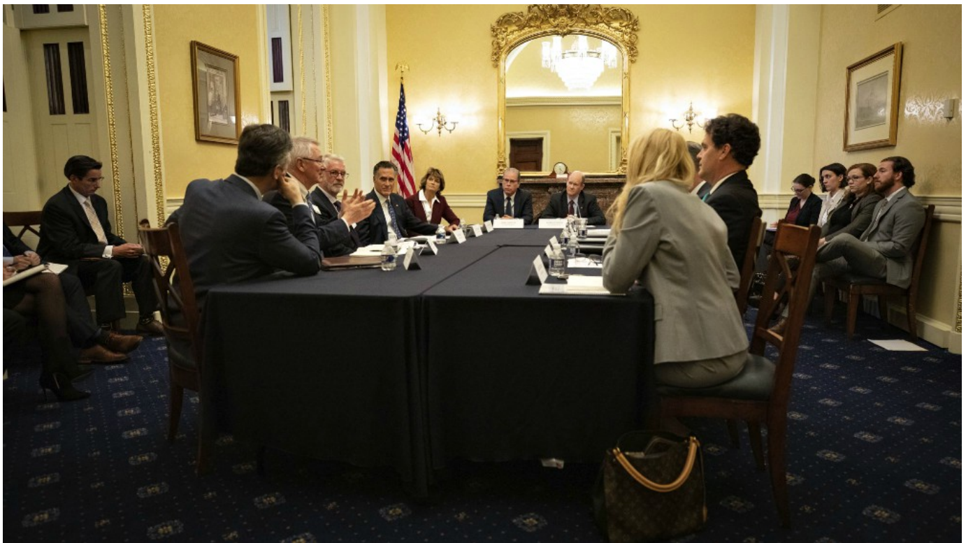
The Senate Climate Solutions Caucus meets in November 2019.

The Senate Climate Solutions Caucus formed in 2019, following the creation of a similar caucus in the House of Representatives three years earlier. The Senate version counts 14 of the 100 senators as members.