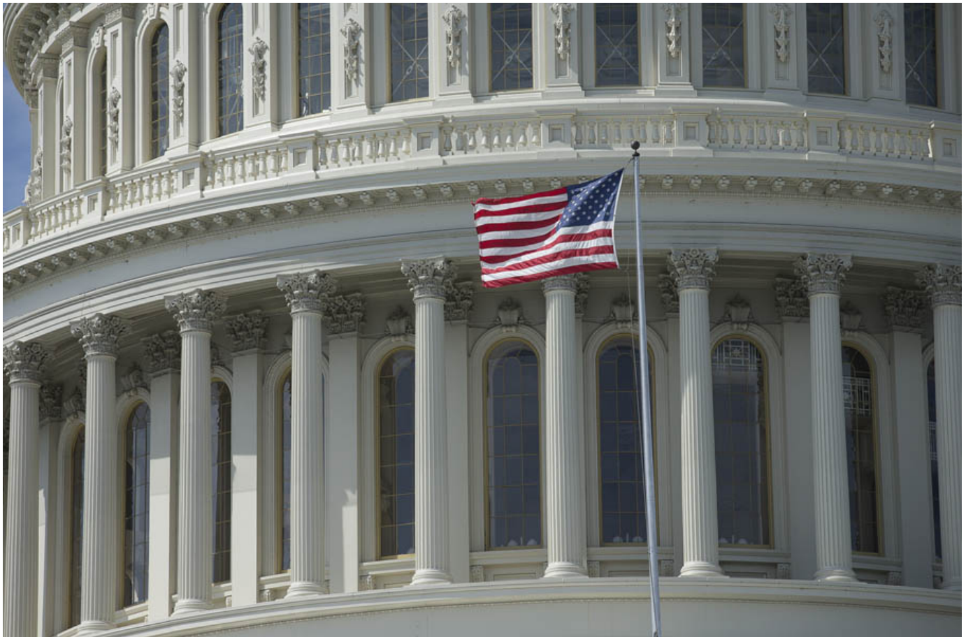
The U.S. Capitol is seen in Washington Sept. 26, 2017.

Republican incumbents Sens. Martha McSally in Arizona and Cory Gardner in Colorado appear headed for defeat, while Susan Collins in Maine and Thom Tillis in North Carolina are both slightly losing according to FiveThirtyEight . Sen. Joni Ernst in Iowa is in the only race rated a toss-up. But, in close races, if the top of the ticket goes overwhelmingly one way or another, not only would Ernst likely lose, other close races would follow. Incumbent Republican Sens. David Perdue in Georgia and Steve Daines in Montana are in close races and, in the case of Montana, facing a formidable opponent in the person of that state's popular governor, Steve Bullock.