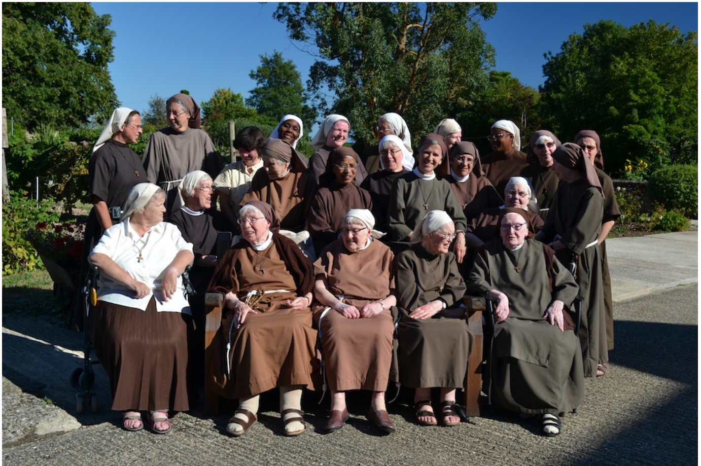
The 23 members of the Poor Clare community in Arundel, Sussex, United Kingdom