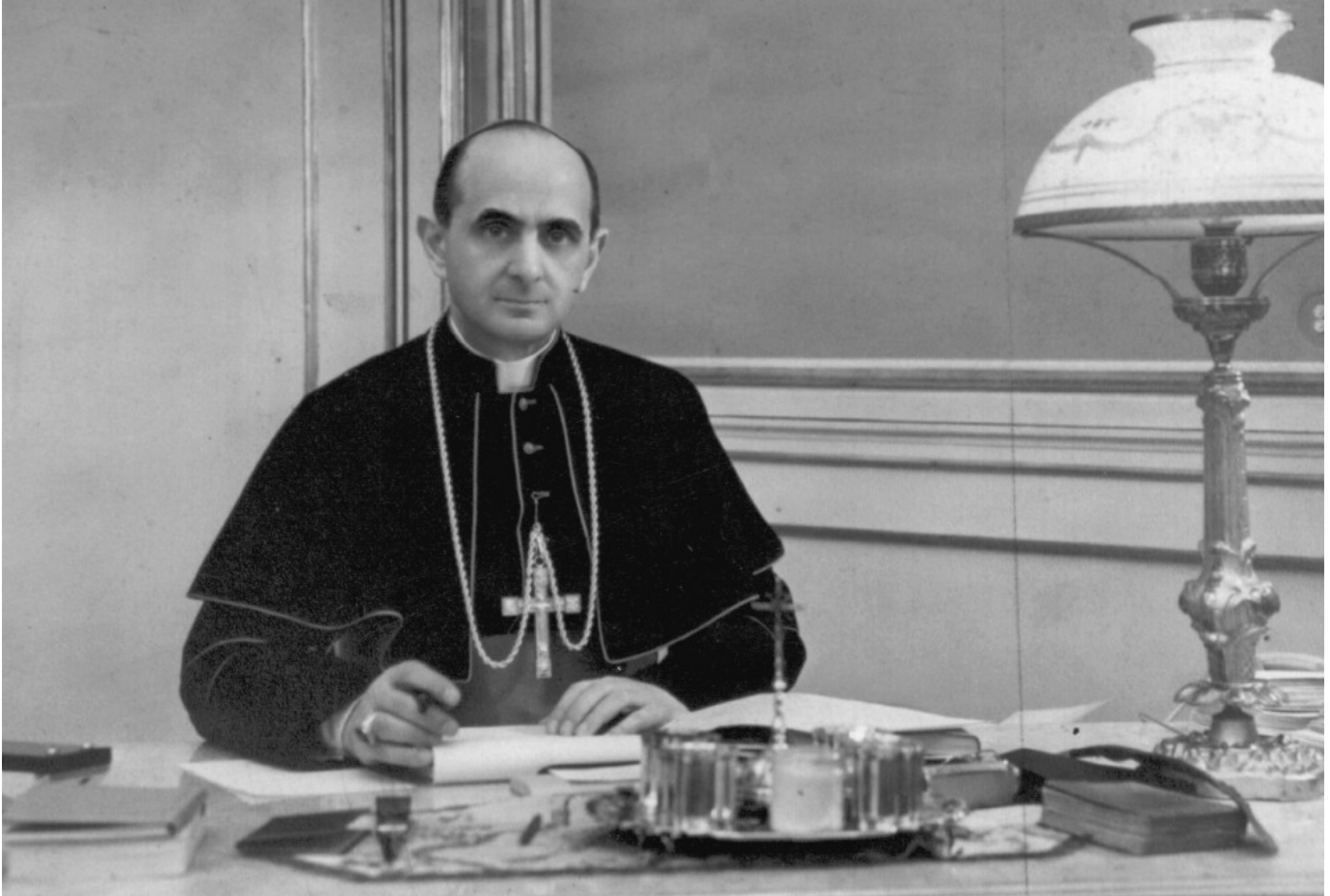
Cardinal Giovanni Battista Montini, who became Pope Paul VI