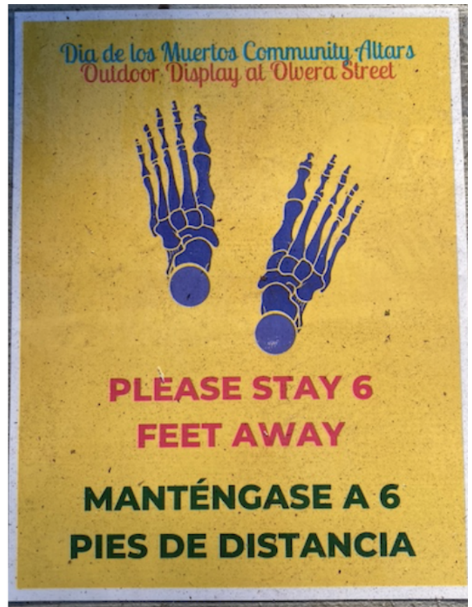
Left: Embroidered masks for sale on Olvera Street, Oct. 23; Right: Sign reminding visitors to Los Angeles Plaza to maintain social distancing while viewing "ofrendas," shopping or going to restaurants