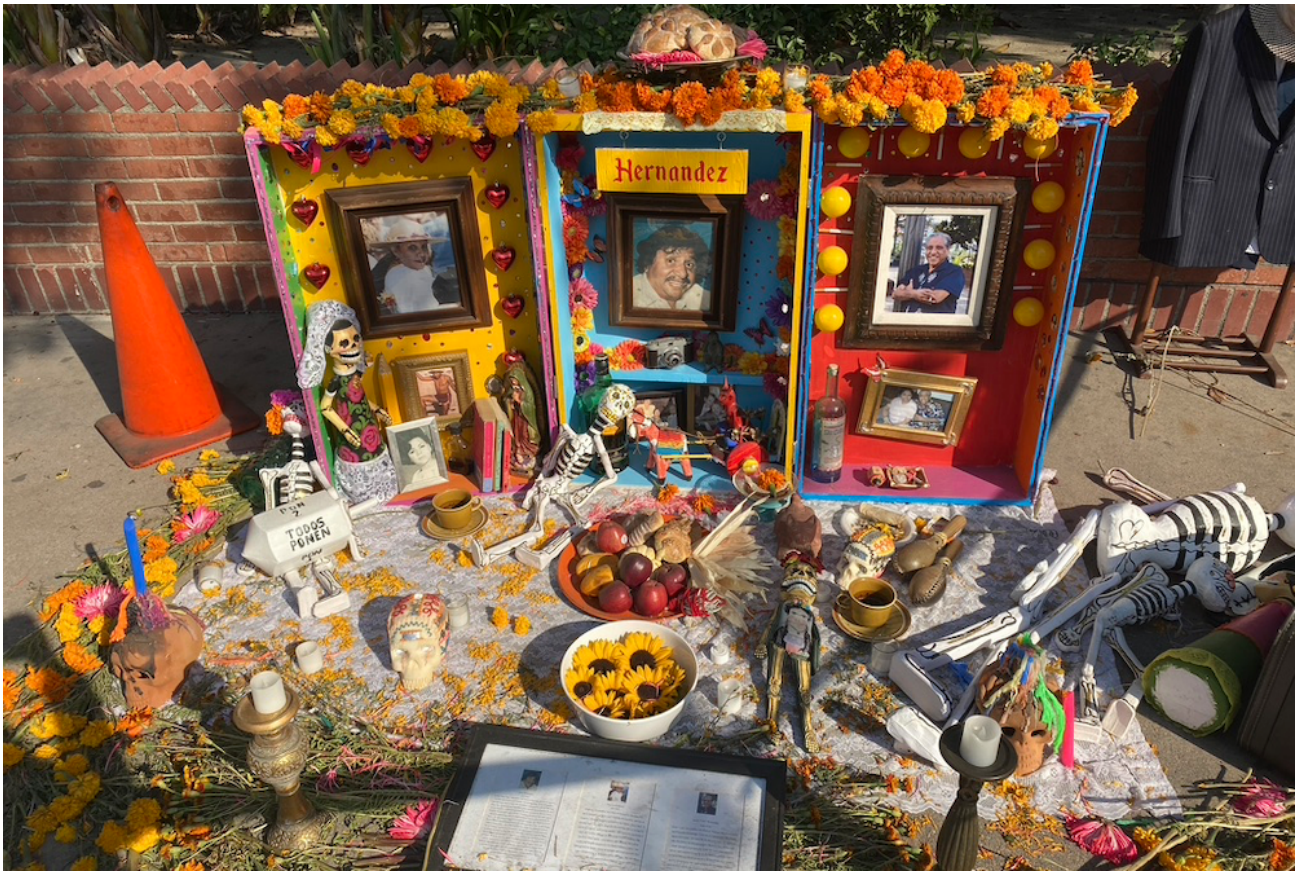
An "ofrenda" in Los Angeles Plaza in the historic center of the city, set up for Day of the Dead