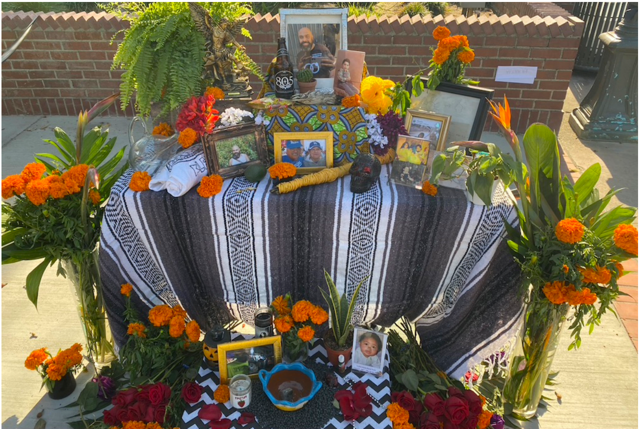
An "ofrenda" in Los Angeles Plaza in the historic center of the city, set up for Day of the Dead