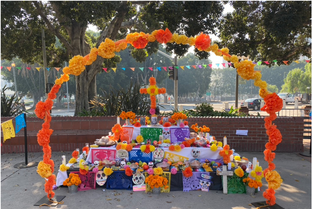
An "ofrenda" in Los Angeles Plaza in the historic center of the city, set up for Day of the Dead