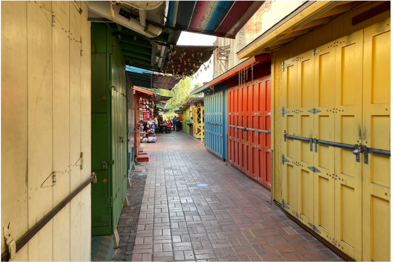
Shuttered shops on Olvera Street, Oct. 23. In the background, people sit outside a restaurant.