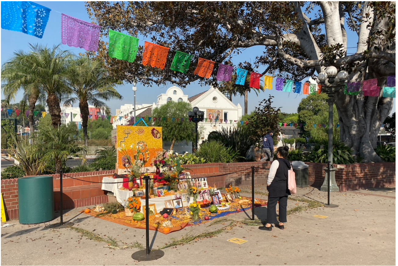
A woman looks at one of the "ofrendas" in Los Angeles Plaza Oct. 23, adjacent to Olvera Street.