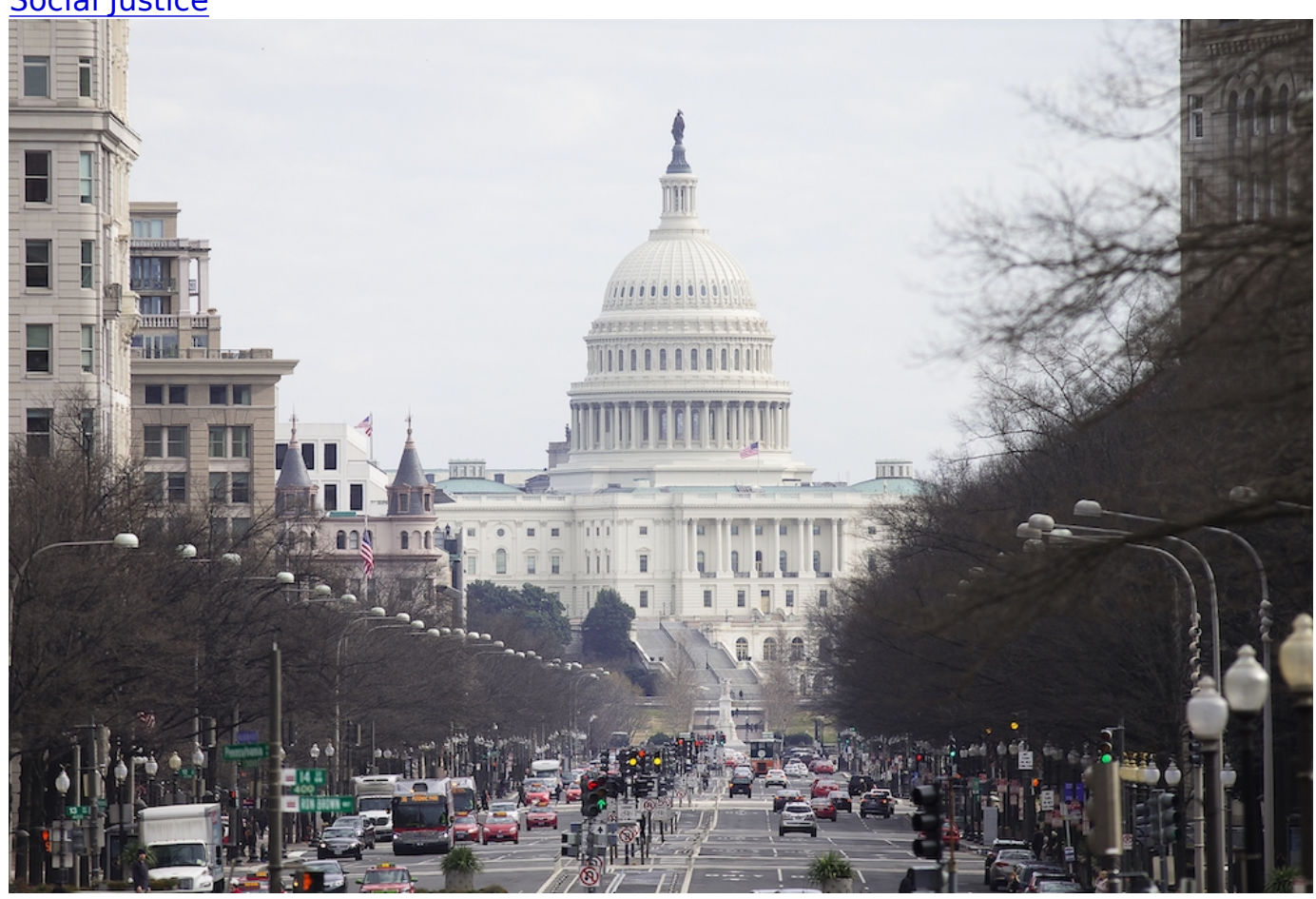
U.S. Capitol, Washington, D.C., Jan. 8, 2019